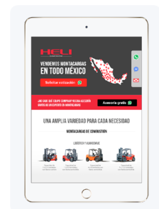
HELI Forklift Landing page