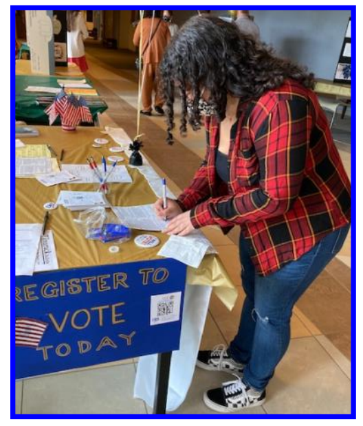
Naugatuck Valley Community College Voter Registration