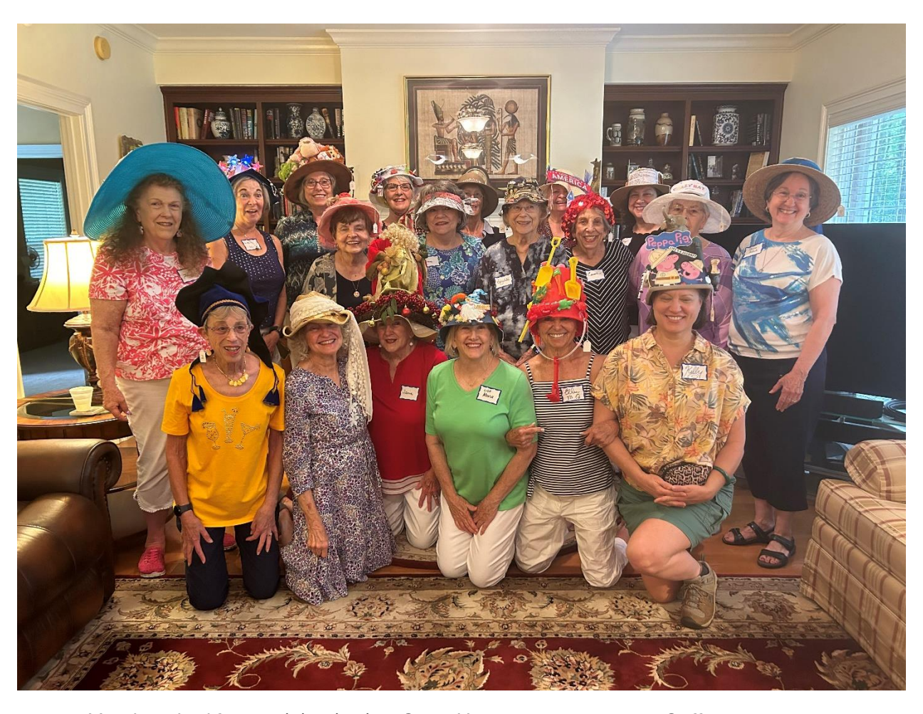
Members had fun participating in a Crazy Hat contest at a recent Coffee.

Social Hour takes place on the fourth Friday of each month at 6 P.M. Members bring a dish to share as well as their own beverage and spouses or guests are welcome.