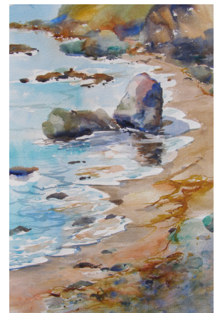
"Shadow and Reflection"