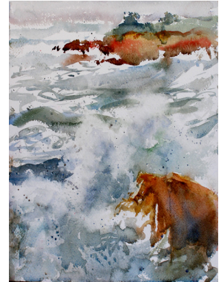
"Surf 2" © Kathy Miller

Hours: 9:00 am to 4:00 pm Doors open at 8:30 for set-up. You may leave your things overnight.