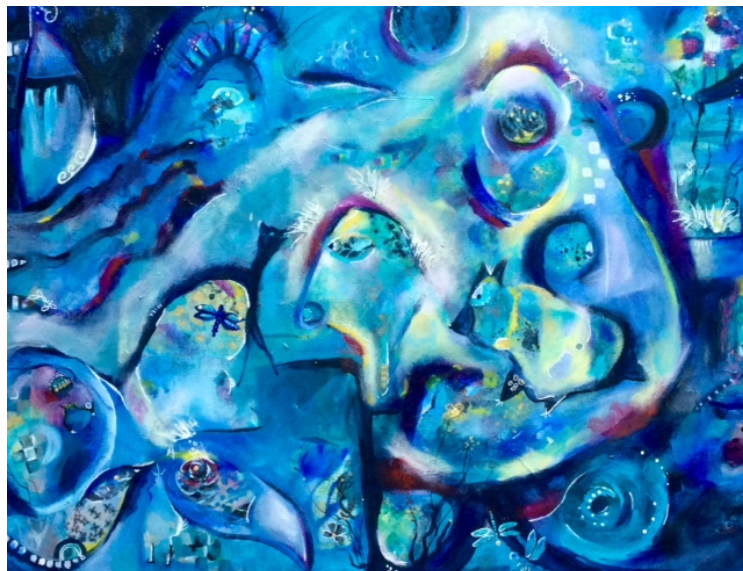
Waging Peace on the Land by Blaire Kilbey

“I paint mostly in encaustic, acrylic, inks, pastels, and bits of mixed media. Brushes, twigs, and fingers are some of the tools I use to create layers upon layers,