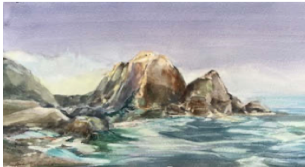
Seascape with Purple Sky by Bob Norwood