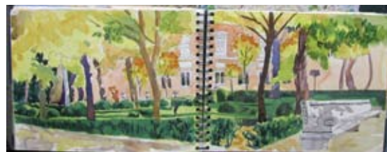
One of Ardella Swanberg's sketch books. The sketch is of a park in Spain.