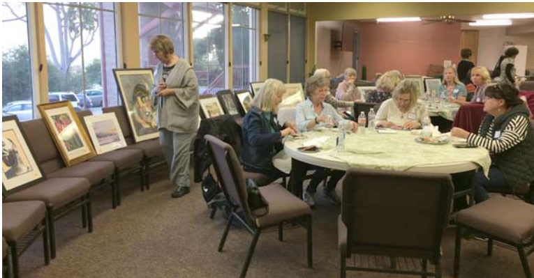
From an event last year, the line of paintings on the chairs gives you an idea of what a typical "Instant Gallery" looks like. Very informal and just a lot of fun!

A 1-Night Only Members' Show and Potluck Dinner