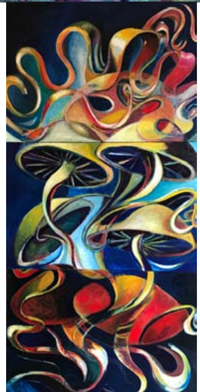
"Mushrooms, 2019" by Judy Gittelsohn

A packet of literature and free samples of paint and gels are available for all those who attend.