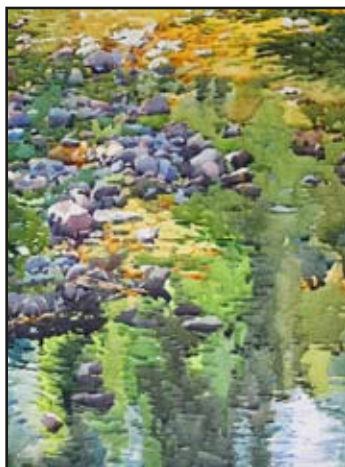
"Rocks and Reflections" by Mark Mehaffey.

Also: The workshop fee includes breakfast snacks, coffee and tea plus lunch and afternoon snacks all 3 days. If you have special dietary requirements please bring your lunch. There is a refrigerator you can use.