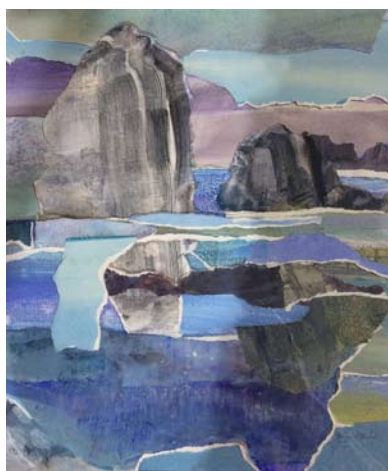
Looks a lot like California's North coast.