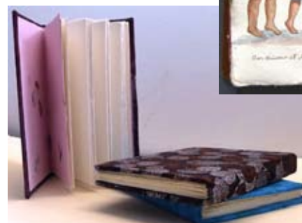
The type of watercolor sketch books that Ardella makes.

Ardella feels that an Artist's Book doesn't have to be filled with beautiful art if you don't have the time