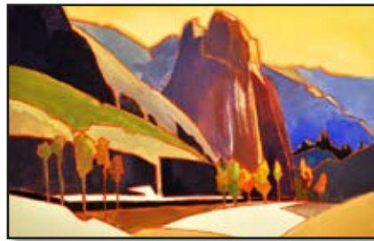
"Sentinel Flats"

Those of you who attended the December 10th meeting got to see all the paintings that were entered for consideration to be in the show. That was great, but of course it is always better to see the ones that were accepted in "real life."