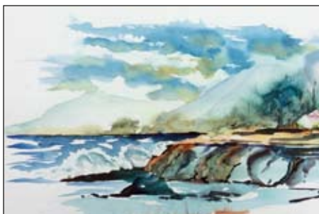
"Home Again," received an honorable mention at last year's CCWS Members Only Show.

I have briefly tried oils and have done a few paintings with acrylics which showed me very quickly where the advantages of watercolor are with respect to color mixing.