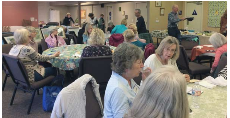
This event is a great opportunity to get to know a new member or just visit with someone you haven't seen in a while.

You can see from the photo that it is quite a "casual" gallery event. We have dinner and then vote for our favorites. A 1st, 2nd, and two honorable mention prizes are awarded. First Place wins $50, Second Place wins $40, and each Honorable Mention receives a check for $30.