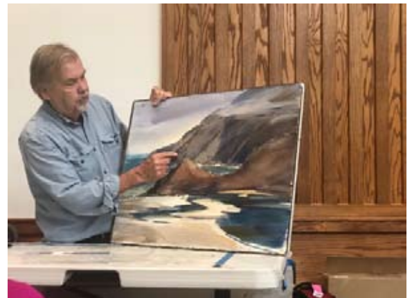
Finished demo painting of Big Sur from day one.