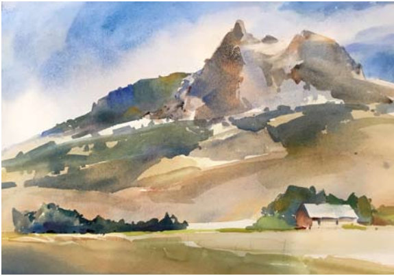
Hollister Peak, day two's demonstration.

light and dark areas are going to appear in the painting. From his sketch he drew the painting on 300 pound rough watercolor paper. He emphasized the fact that we are the “artist” and therefore, if we want to move things around we may do so. He added a farm-