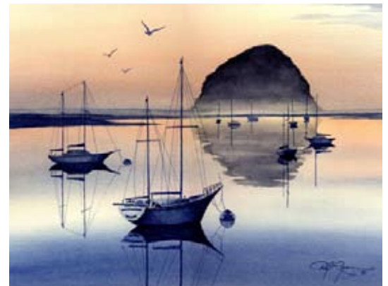
This is not his finished demo, but the same painting from his website. Not the first time he's painted this beautiful view.

For more information on his art and classes at his studio in Morro Bay, visit his website: davidjrogersart.com