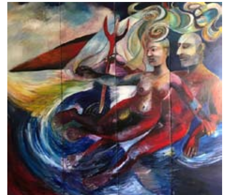
“Neptune and Amphitrite” 75.5” x 84”

A packet of literature and free samples of paint and gels are available for all those who attend.