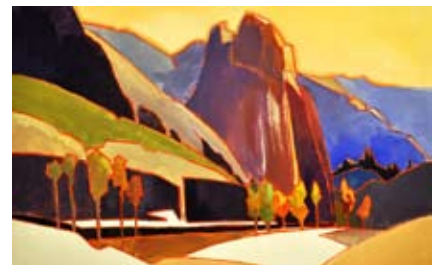
"Sentinel Flats"

The workshop will be Thursday, Friday and Saturday, Feb 20 - 22nd, 9:00 am – 4 pm at the Nipomo Community Presbyterian Church, 1235 N. Thompson Avenue, Nipomo, CA. Please see the CCWS website for more information.