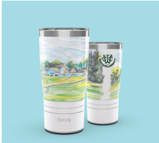
Watercolor Course - Stainless