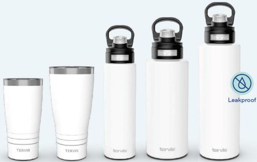
20 oz. Tumbler