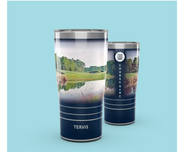
Photo Placement with Logo