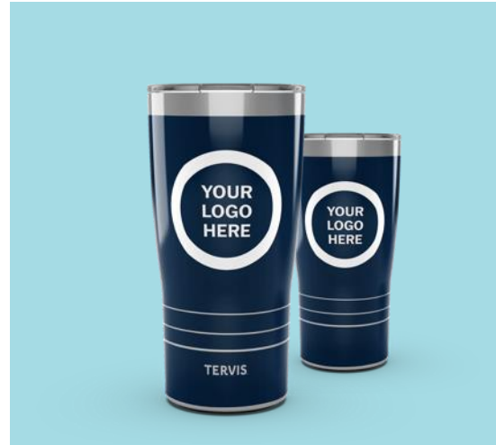
Dual Logo Placement