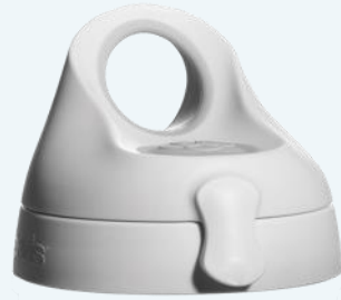
Water Bottle Lid

Makes carrying comfortable with ergonomic loop.