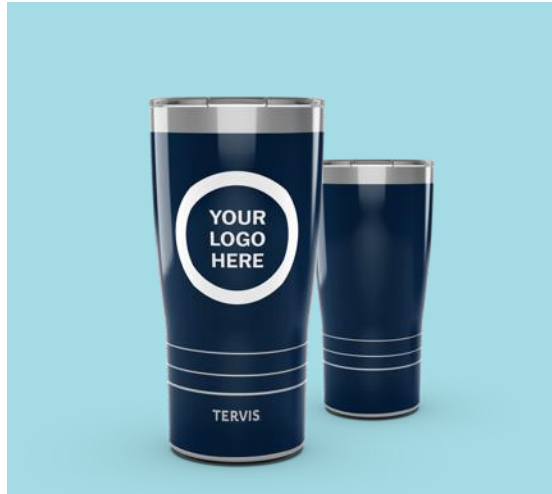
Single Logo Placement