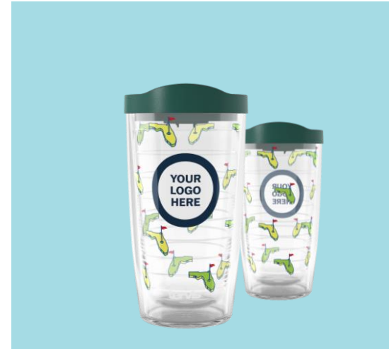
Golf State of Mind