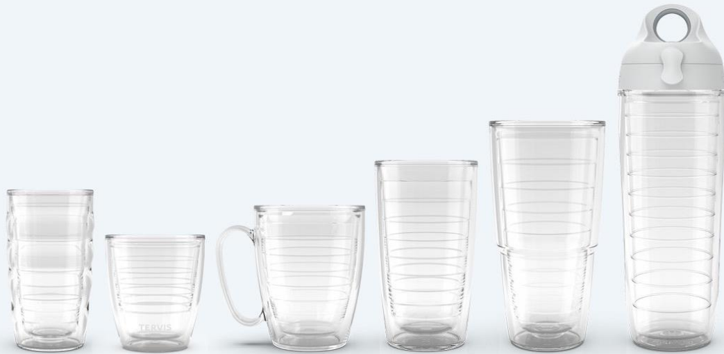
10 oz. Wavy