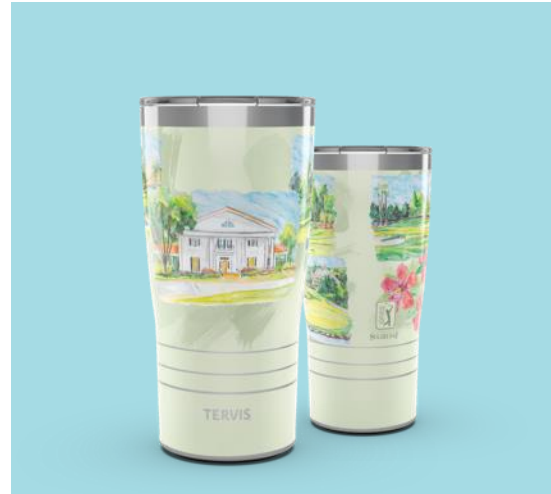
Watercolor Course - Classic