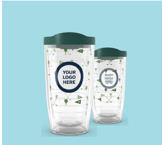
Matter of Course