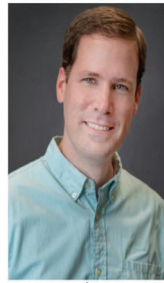
COLDWELL BANKER | GLOBAL LUXURY SEA COAST ADVANTAGE

Hiring an experienced REALTOR® can put more money in your pocket and make the process of buying or selling your home easier.