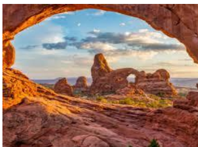
Arches National Park