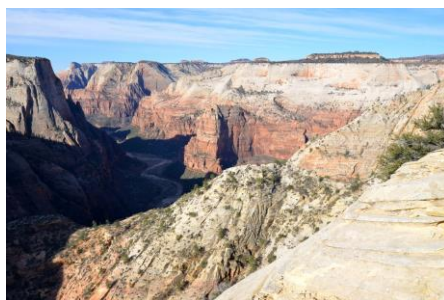
Zion National Park

*This tour requires average physical activity. Participants should be in good health, able to climb stairs and walk reasonable distances, possibly over uneven ground or unpaved trails. This tour covers areas of higher altitudes including overnight locations above 7,000 ft. and touring above 9,000 ft. Most activities are at your own pace.