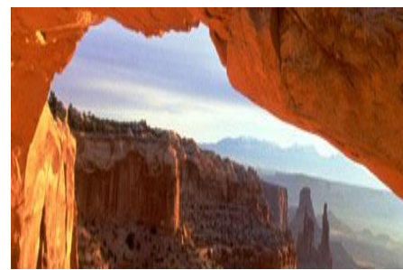
Dead Horse Canyon