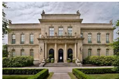
Mansion Tour of The Elms or the Breakers