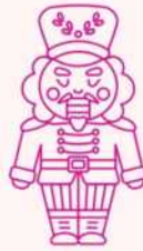
LAST PAGE ADVERTISEMENT