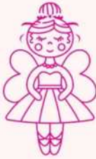
INSIDE COVER ADVERTISEMENT