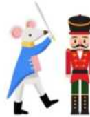
HALF PAGE ADVERTISEMENT