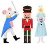
FULL PAGE ADVERTISEMENT