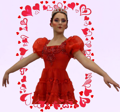
Queen of Hearts