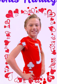
Jack of Clubs