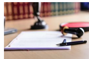
Proprietary Info Competitive Value