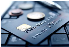
Credit Card Info $2 - $5 (Per record)