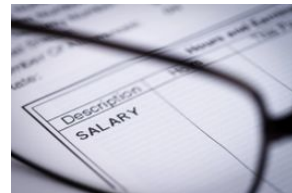
Employee PII (Personally Identifiable Information) $20-$450 (Per record)