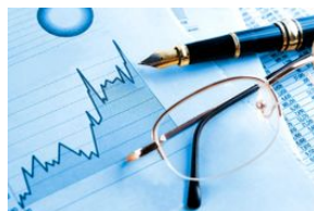
Sales/Financial Info Competitive Value