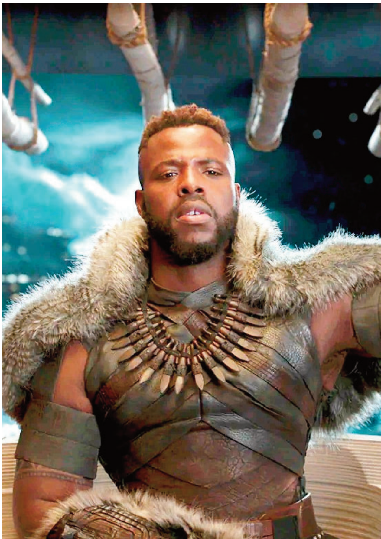
Tobagonian Watson Duke reprises his role as M’Baku in Wakanda Forever