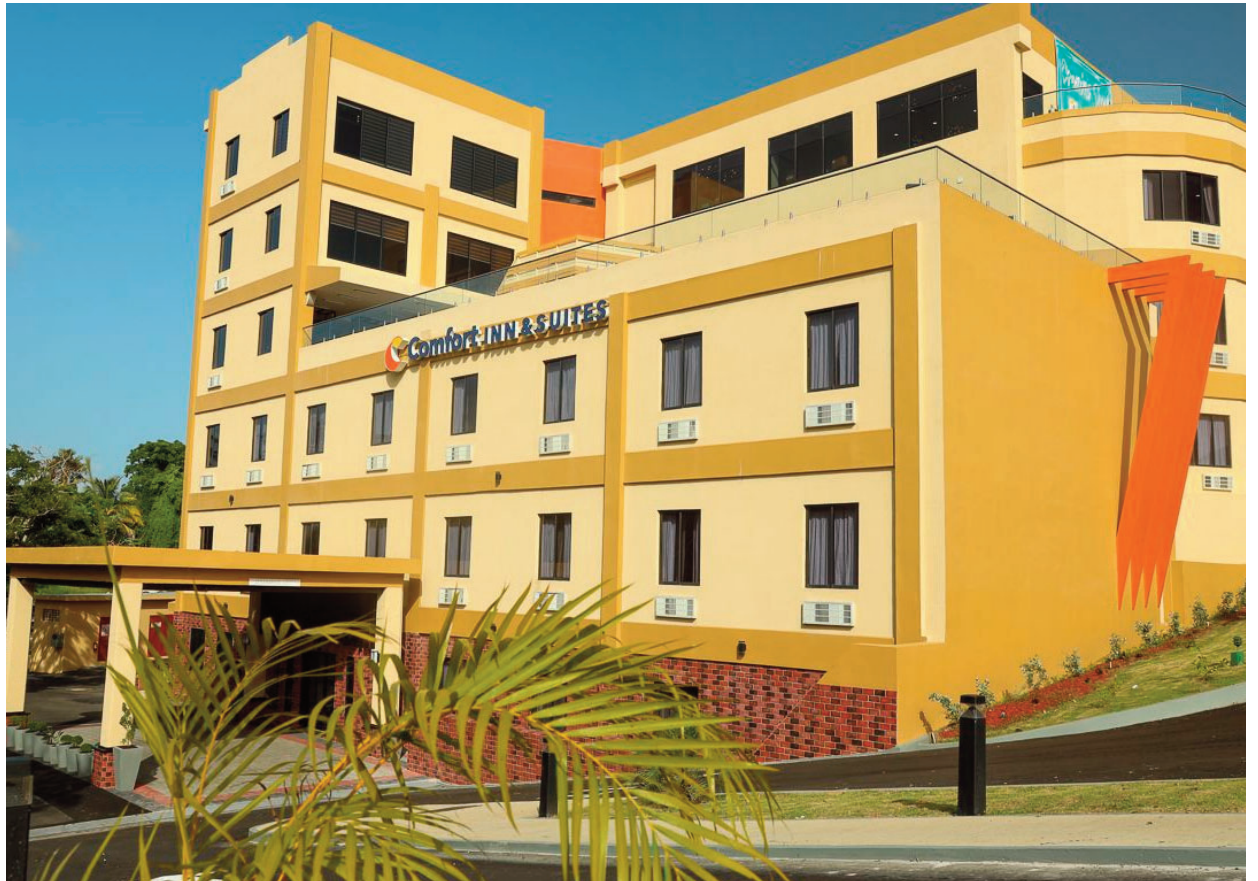
The brand new Comfort Inn in Scarborough, Tobago

In-room amenities include a mini fridge, microwave oven, coffee percolator, electronic safe and premium movie channels. Outdoor features include a spa open to guests and non-guests, as well as a restaurant which serves breakfast, lunch