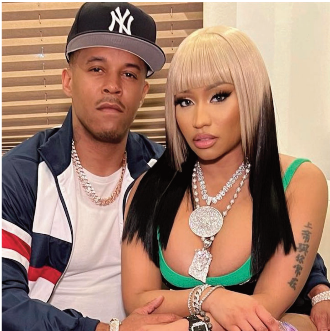
Nicki Minaj and her husband Kenneth Petty

Meanwhile, none of the artists mentioned has spoken out, and Nicki Minaj herself issued a denial claiming that the attempt was a take-down by “another fan base,” which she did not name.