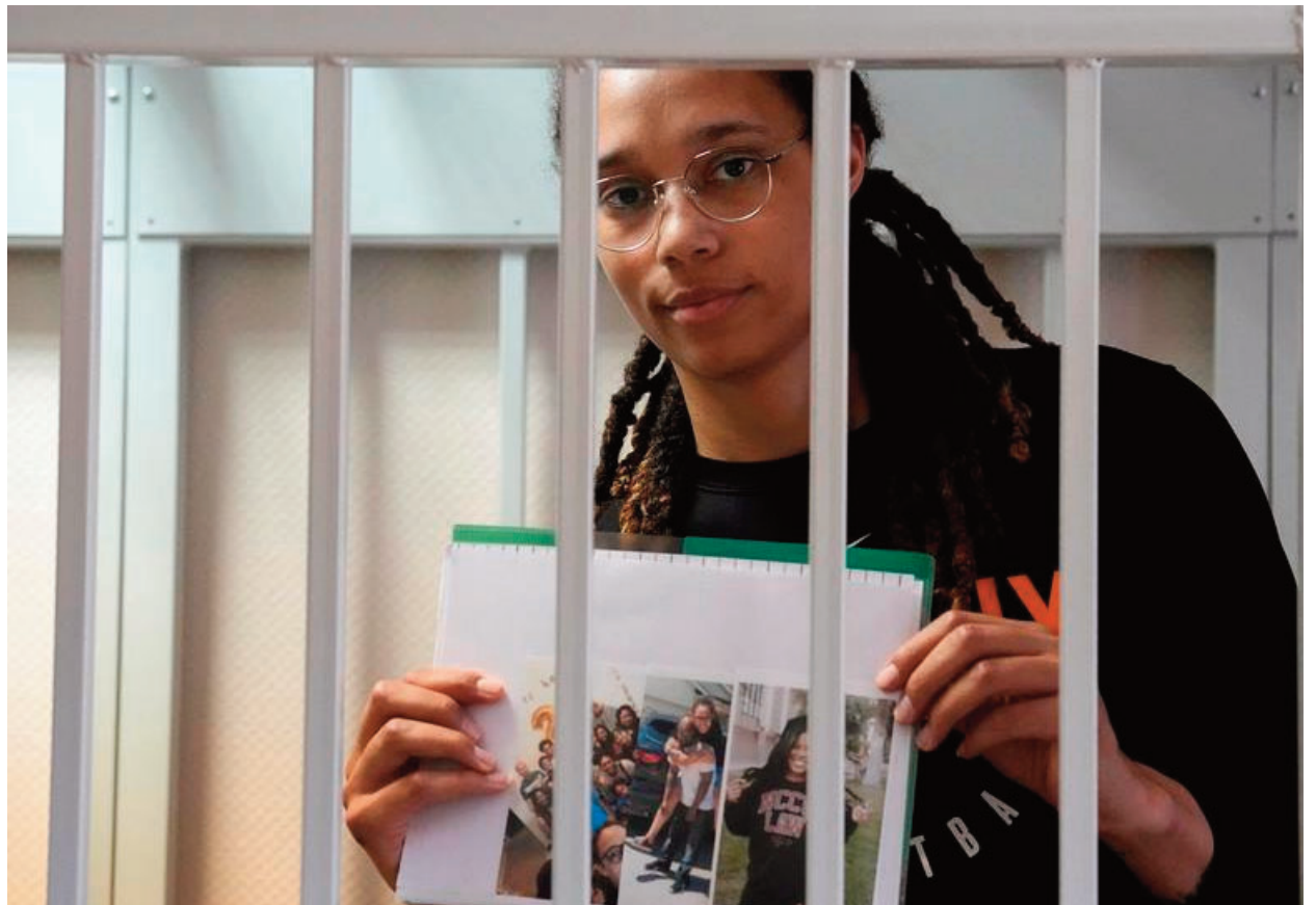
WNBA Star Brittney Griner: sentenced to almost 10 years in a Russian jail

Meek Mill also tweeted a message, "Free BG ... let's fight for her!!!!!!!"