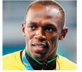
Usain Bolt drops '9.58 riddim'