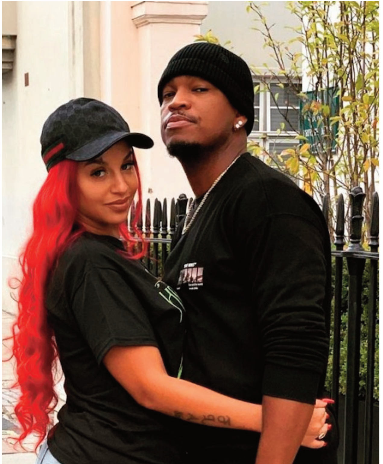
Ne-Yo and Crystal Smith in happier times

Ne-Yo has not filed an answer to the divorce