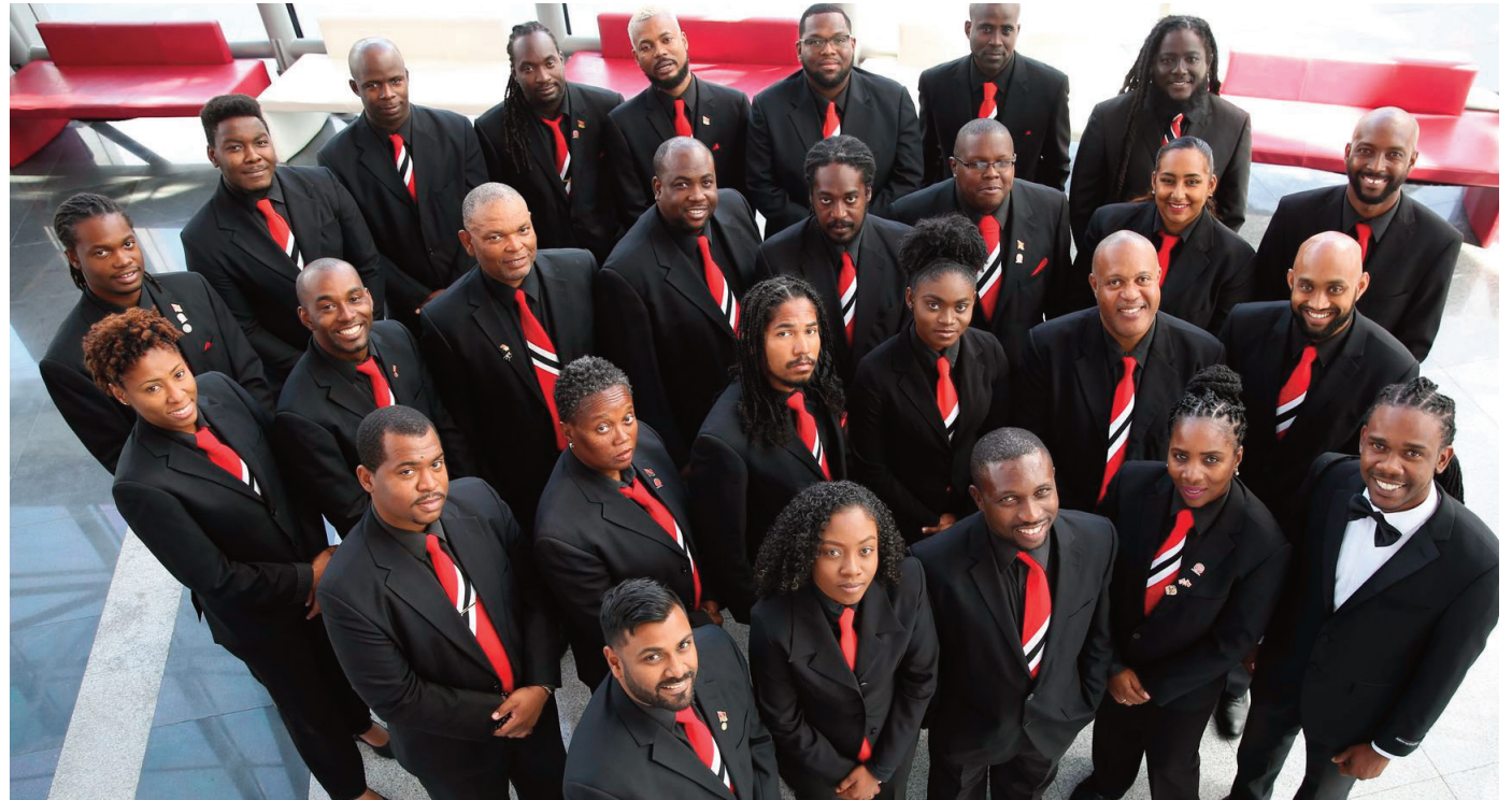
Members of the T&T National Steel Symphony Orchestra

History states that pan was invented in 1939; T&T first competed at Olympics under the then-new national colours, red, black and white in 1964, two years after gaining In-