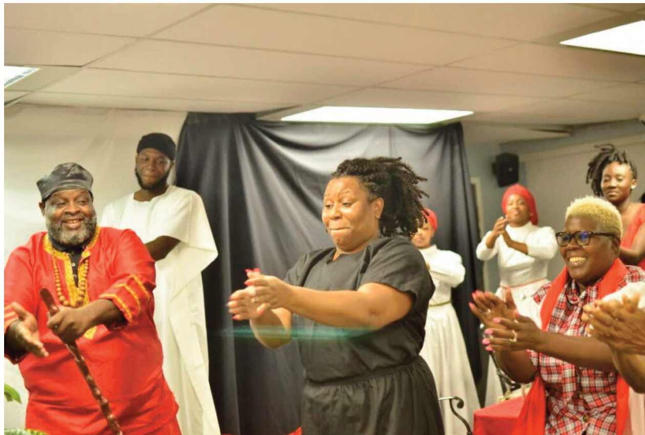
Above and left: Scenes from Blood Money as it played at the Trinidad and Tobago Consulate in Toronto