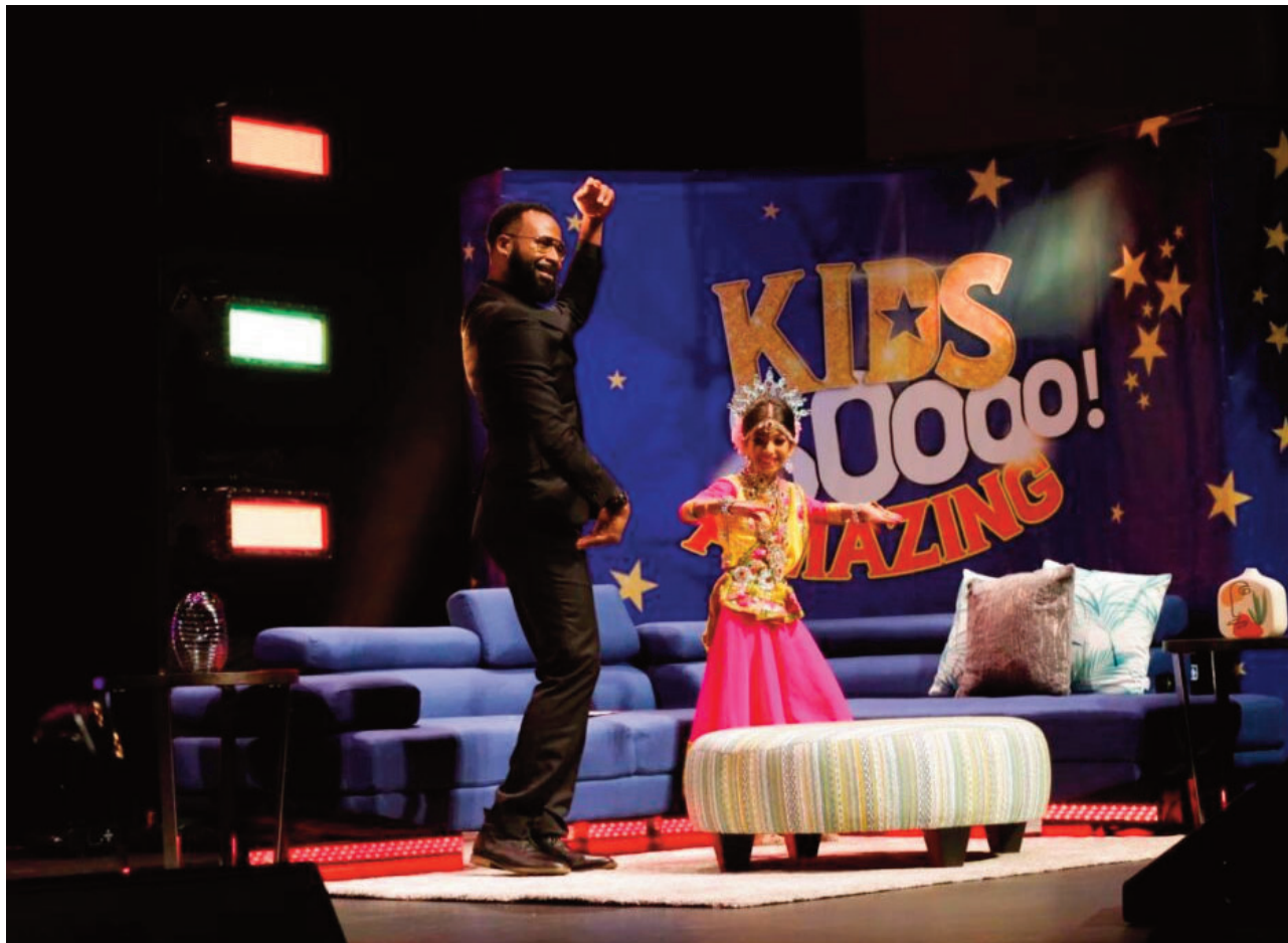
In the TV show, Kids So Amazing, Ro'dey will invite children to perform.

"We auditioned over 30 children. We had a short space of time to work with. When the show got the approval to move forward, we had to do