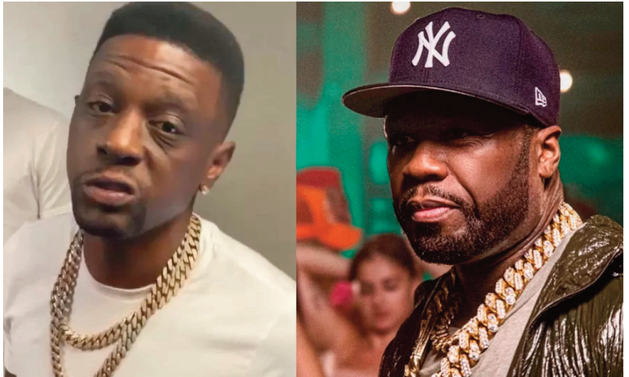
Boosie Badazz and 50 Cent are among the artistes reacting to the jail term

50 Cent also reacted as he said the basketball athlete is caught in geopolitics between the