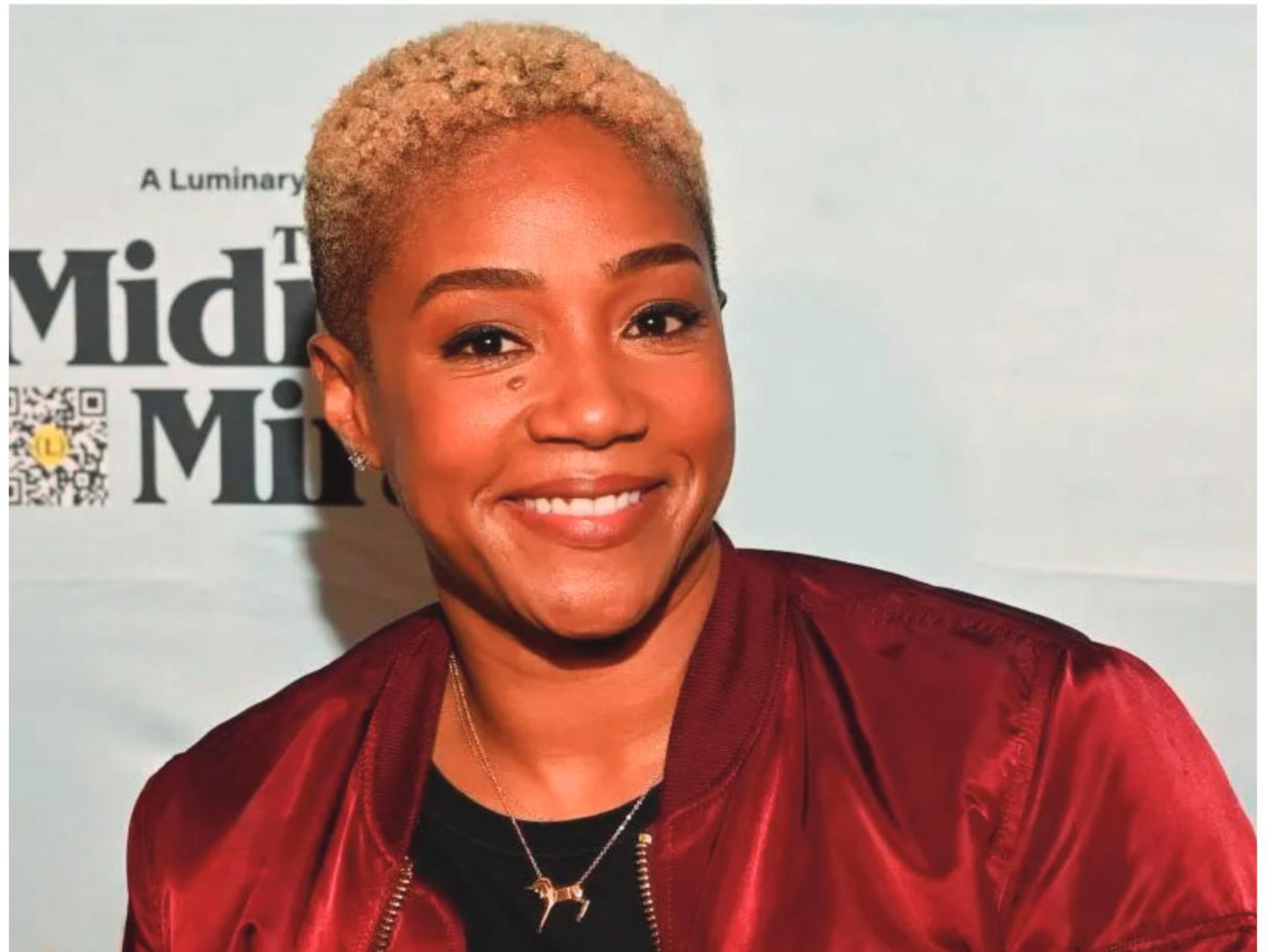
Tiffany Haddish: suffered several losses in the days before her arrest in Georgia