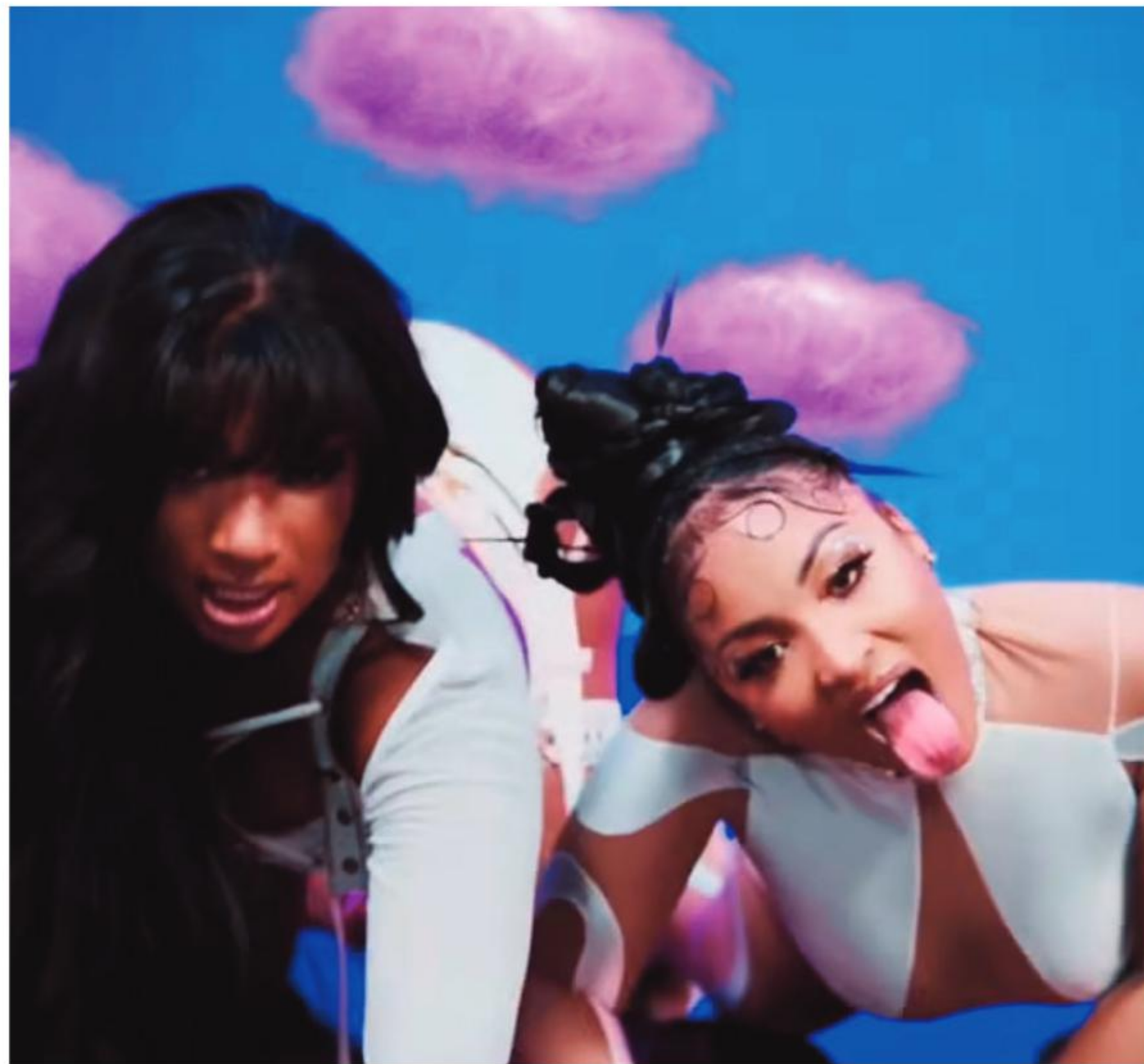
Shenseea (r) and Meghan Thee Stallion in a promo shot for Lick

wrong if there is more money in the mainstream, but it looks to me like the industry will dispose of her pretty quickly".