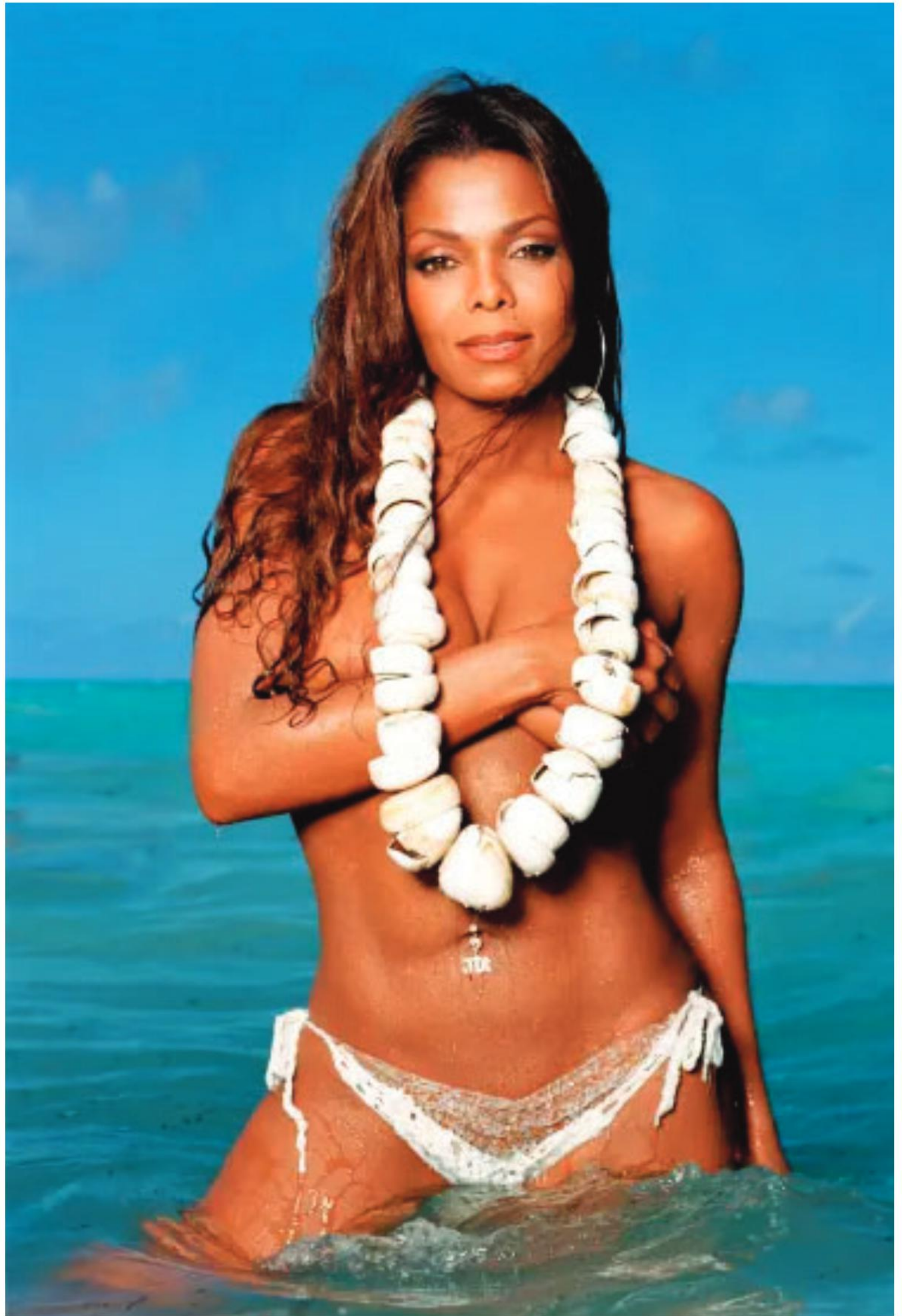
Janet Jackson: marriage to James DeBarge was painful

She said: "We would be rolling on the floor fighting for them. And that's not a life