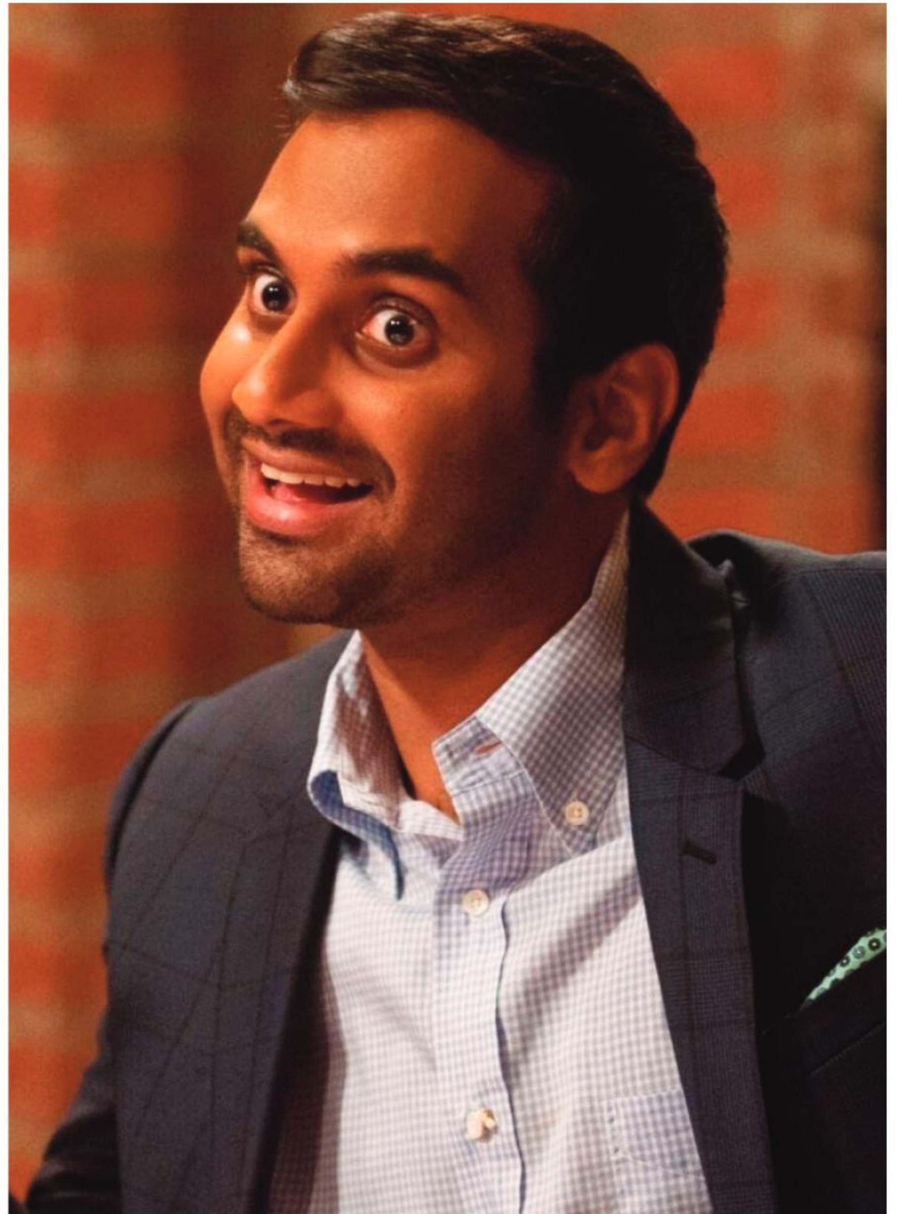
Comedian Aziz Ansari: on a mental diet

"An assistant or whatever - but all that stuff I do I think helps me get more done, kinda taking care of stuff or whatever, whether it's working out or meditating and all that kind of stuff."