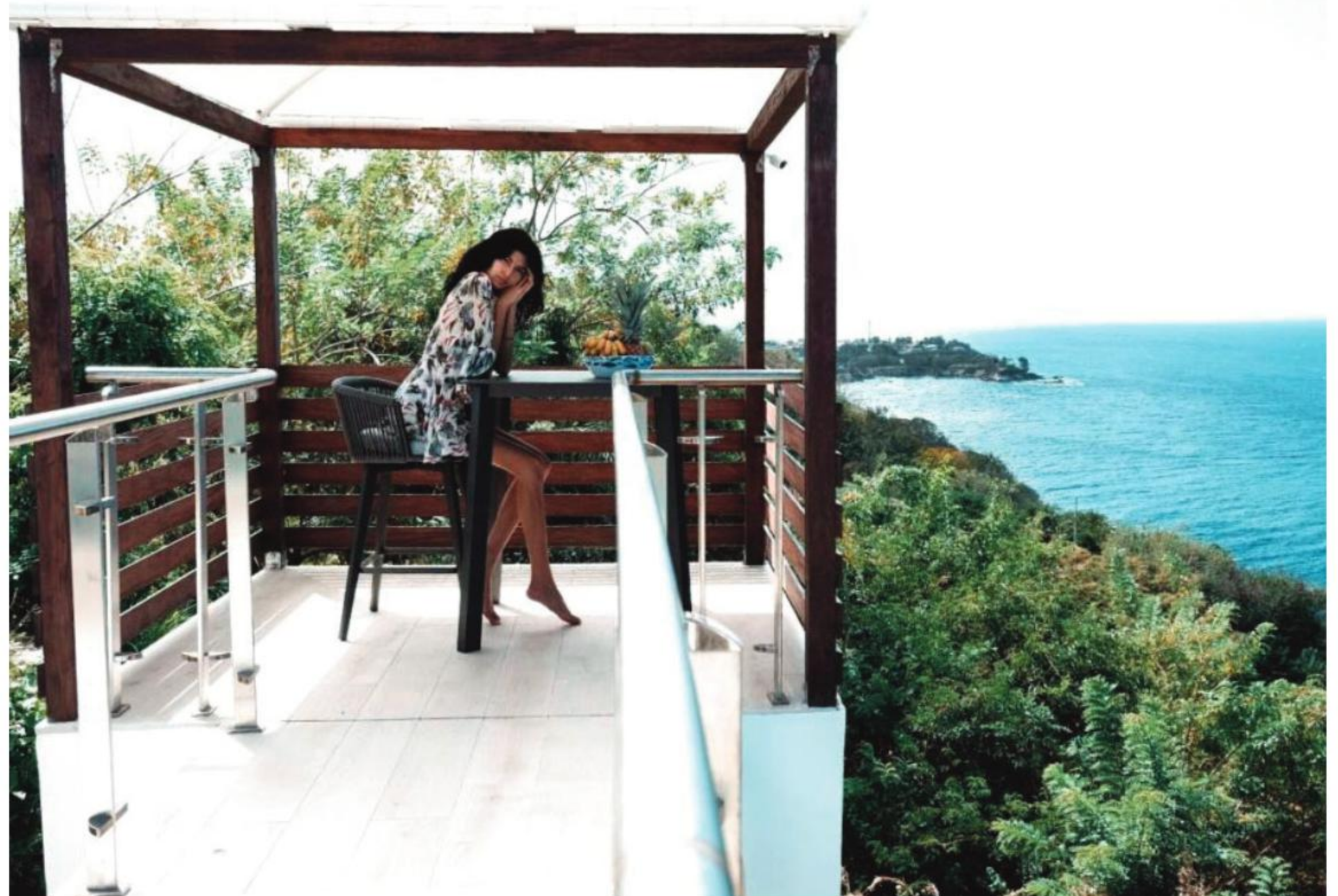
A guest enjoys the breathtaking view at Height of Being, Arnos Vale, Tobago

This is not the first venture of Poon in tourism investment as Height of Being is an addition to the original Villa Being which was voted by the international publication Forbes Magazine as one of