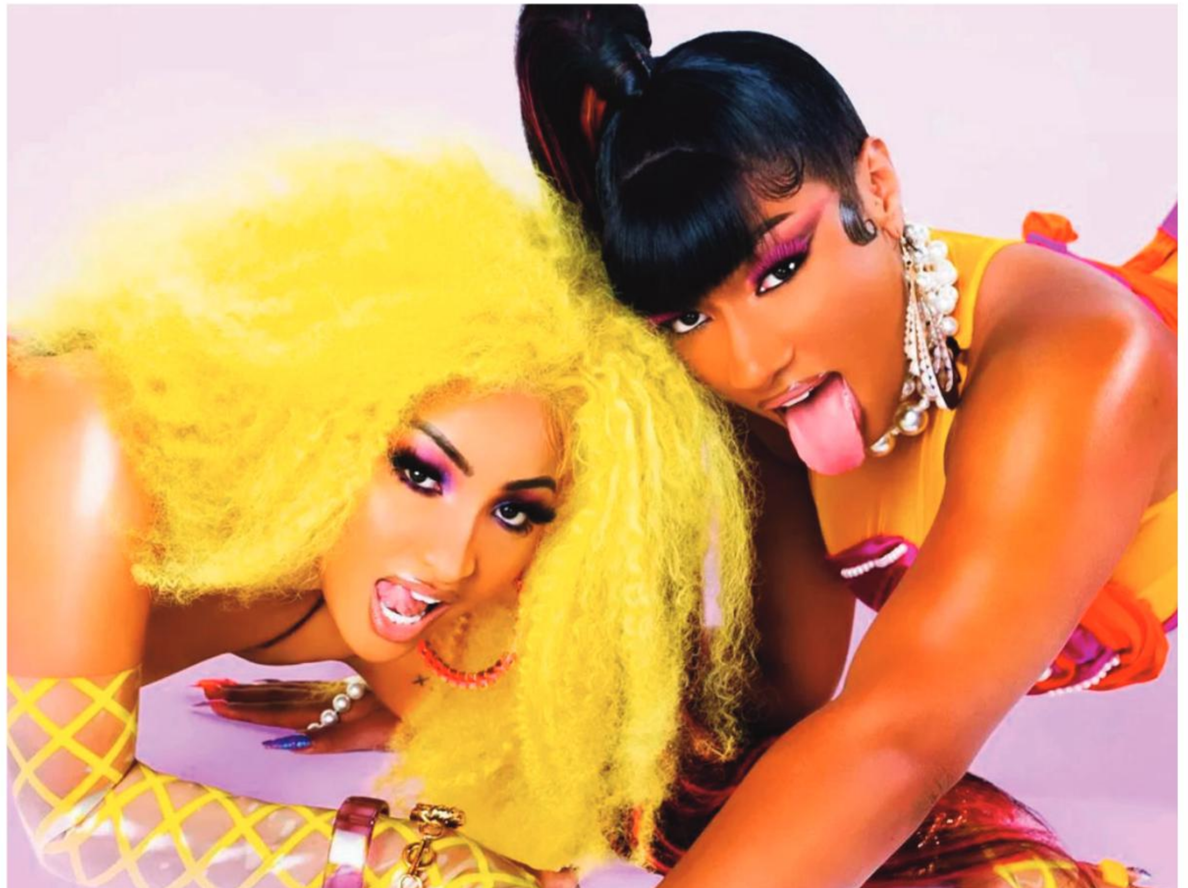
Shenseea and Megan Thee Stallion want people to learn how to lick it good

The not-so-subtle music video features an assortment of lickable treats — lollipops, popsicles and ice cream cones — set amid a cotton candy-colored landscape.