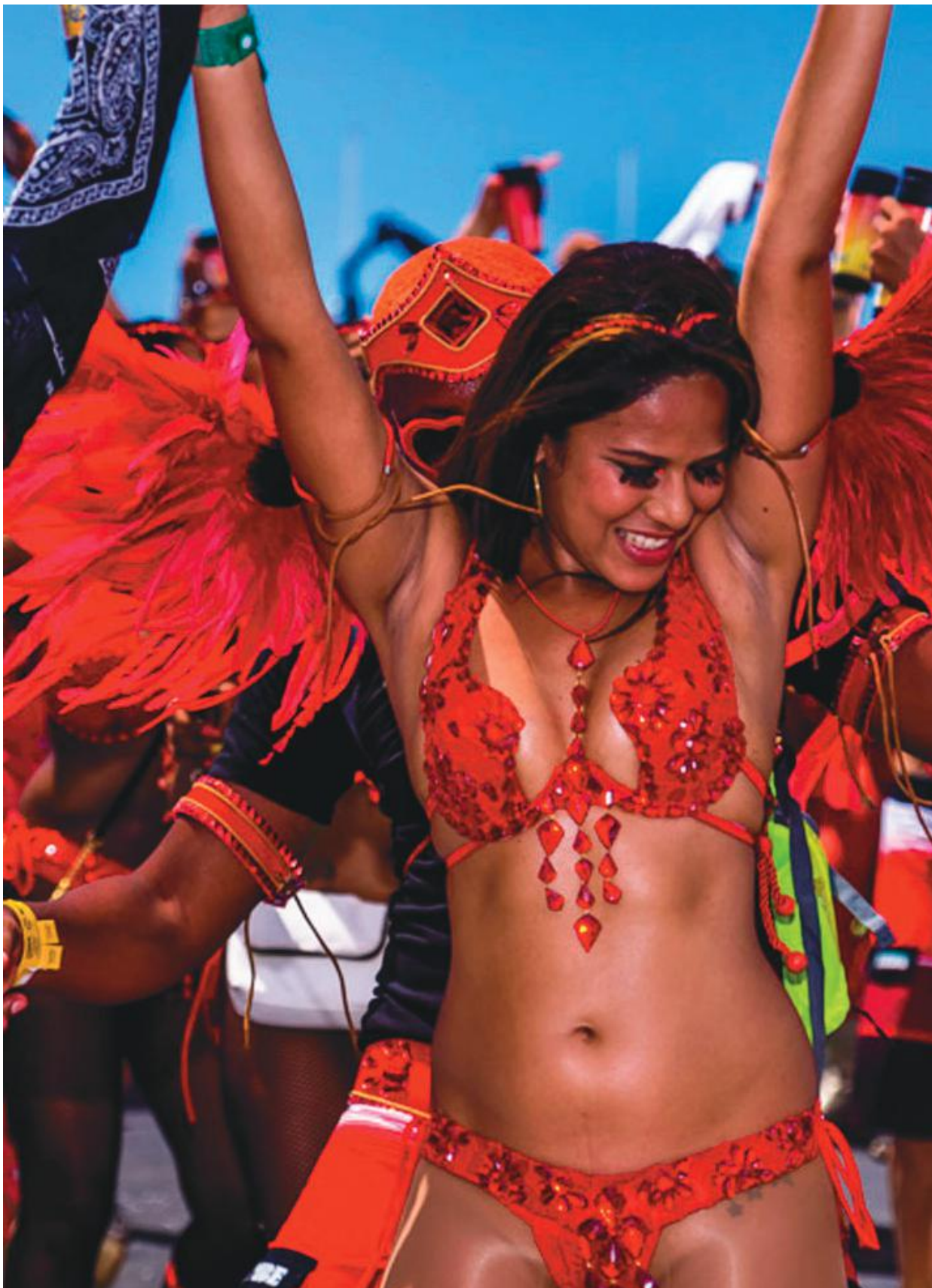
Scenes like this make Trinidad Carnival a major attraction for visitors

Wiens, who visited Trinidad earlier in September, partnered with the ministry’s “Visit Trinidad” for several food tours around the country. Since then, Wiens has uploaded six videos from his time here, gaining millions of views and comments. Many non-nationals expressed their love and appreciation for Trinbagonian food and