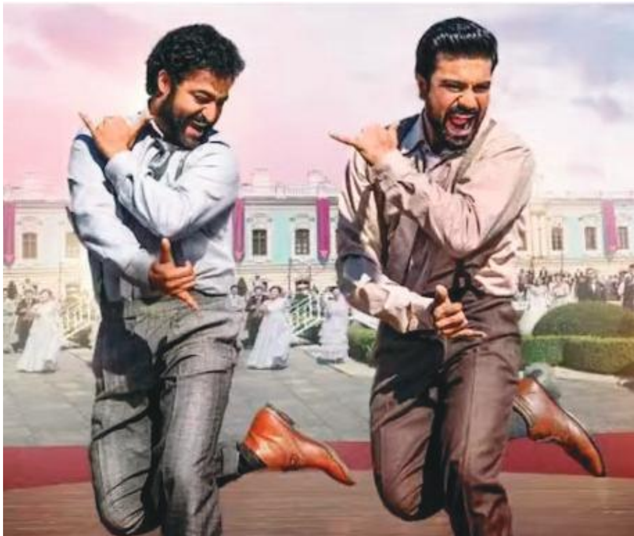
A scene from RRR, which won the Golden Globe for Best Song: a first for India

Fans worldwide have gushed over the infectious dance steps that accompany the song's