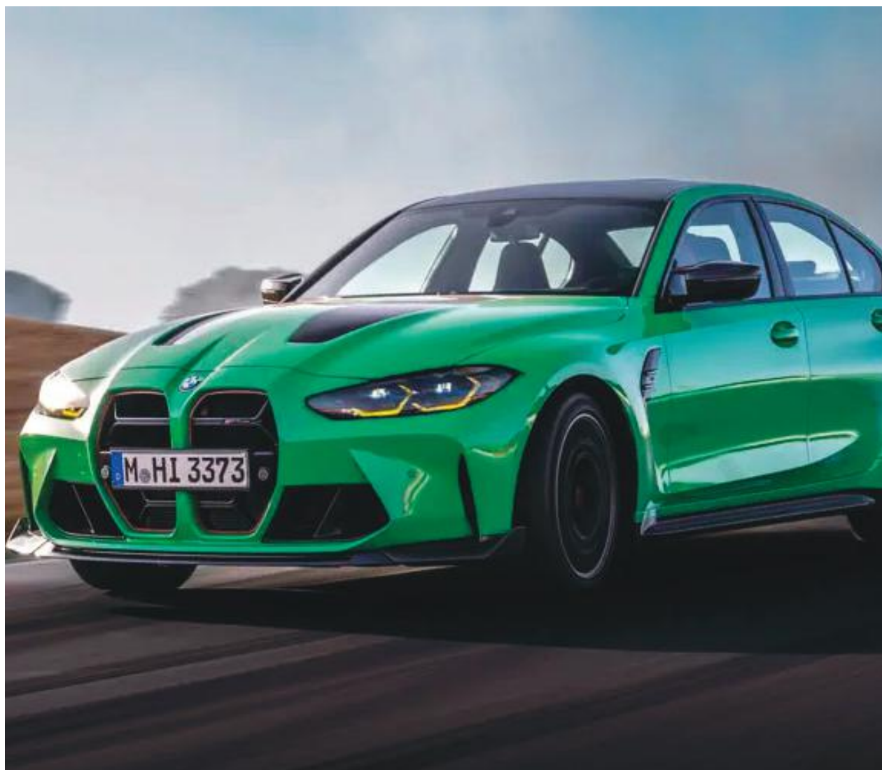
The new BMW M3 CS: available from March

The six-pot's matched to an eight-speed automatic gearbox, an active diff and M's 'xDrive' 4WD setup. It's been given a rear-bias of course, which can be intensified by switching into 4WD Sport mode – directing more of those horsies to the back – or indeed disengaging the front axle entirely by switching off DSC and making it fully RWD. Prepare to get