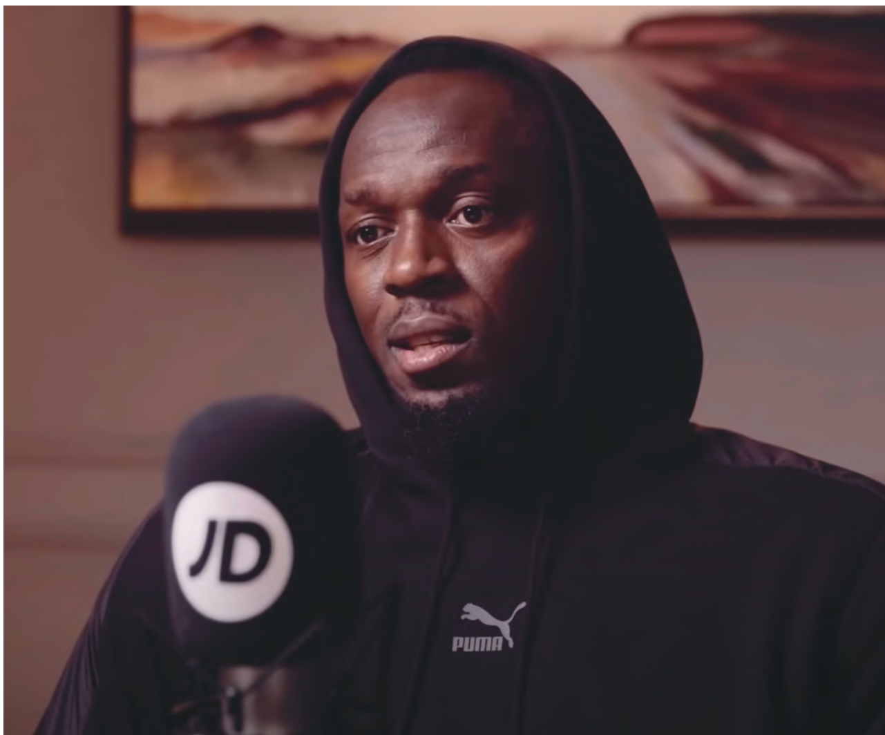
Usain Bolt: missing US$13 million, or more than J$1.2 billion

"The real ones see through all the PR distractions. #Focus," the sprinting legend posted alongside a photo of him gazing into the camera to Bounty Killer's "Look Into My Eyes."