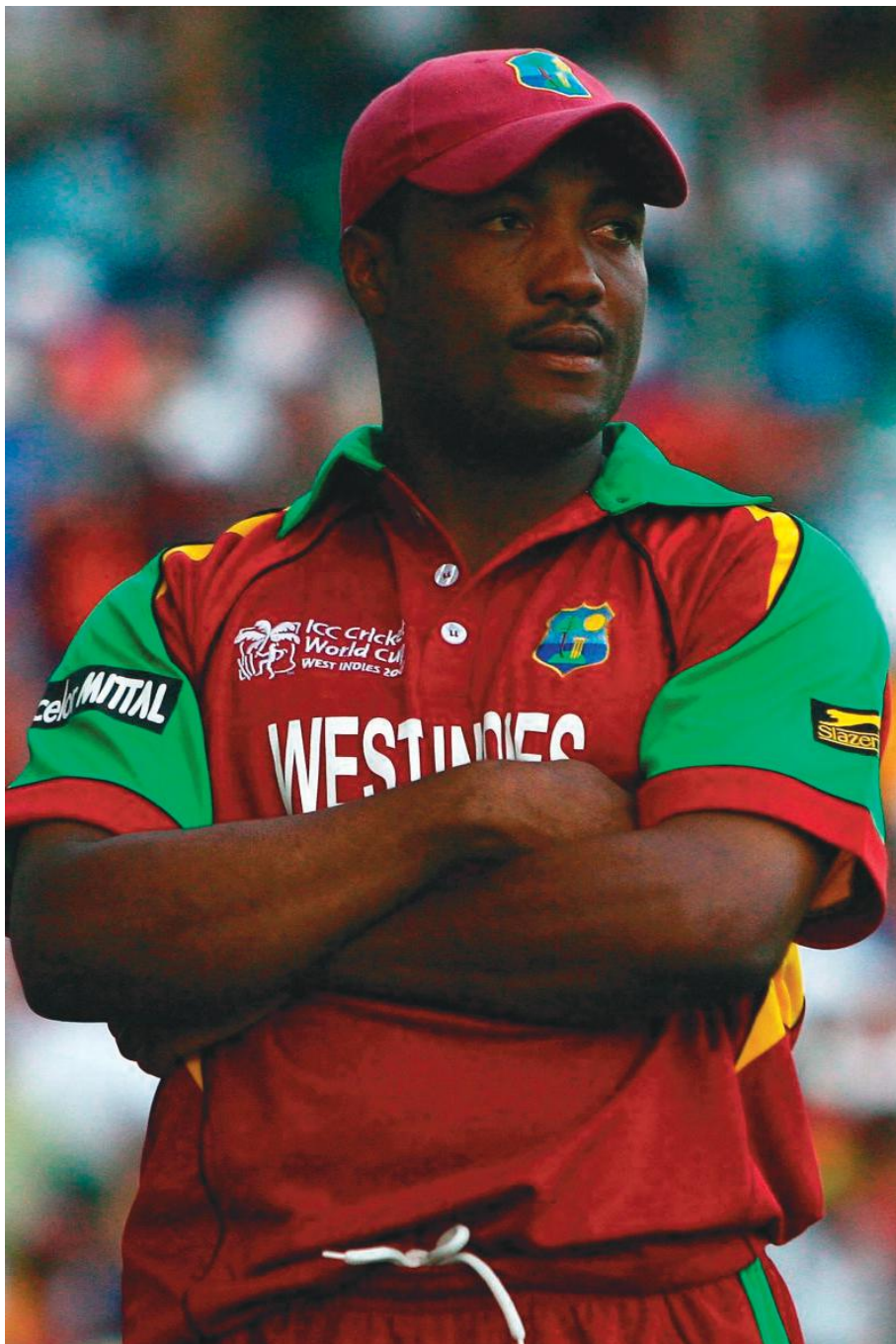
Brian Lara: Prince of Port of Spain back on WI team

Brian takes up the bat for West Indies cricket again