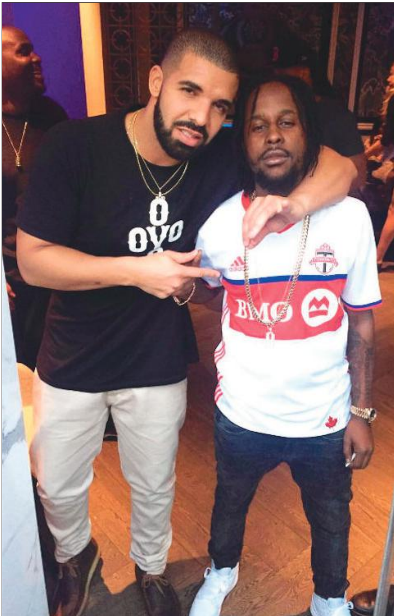
Drake (left) and Popcaan

"We Caa Done" will appear on Popcaan's forthcoming album, Great Is He, due this year. The dancehall star released a single off the project in December titled, "Set It."