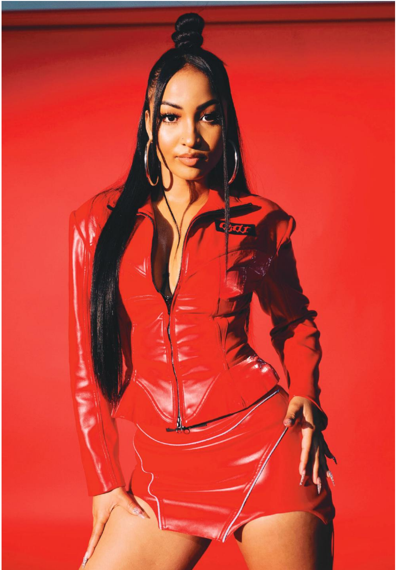
Shenseea will perform at Cocachella in April

“You were a spectator last year and this year