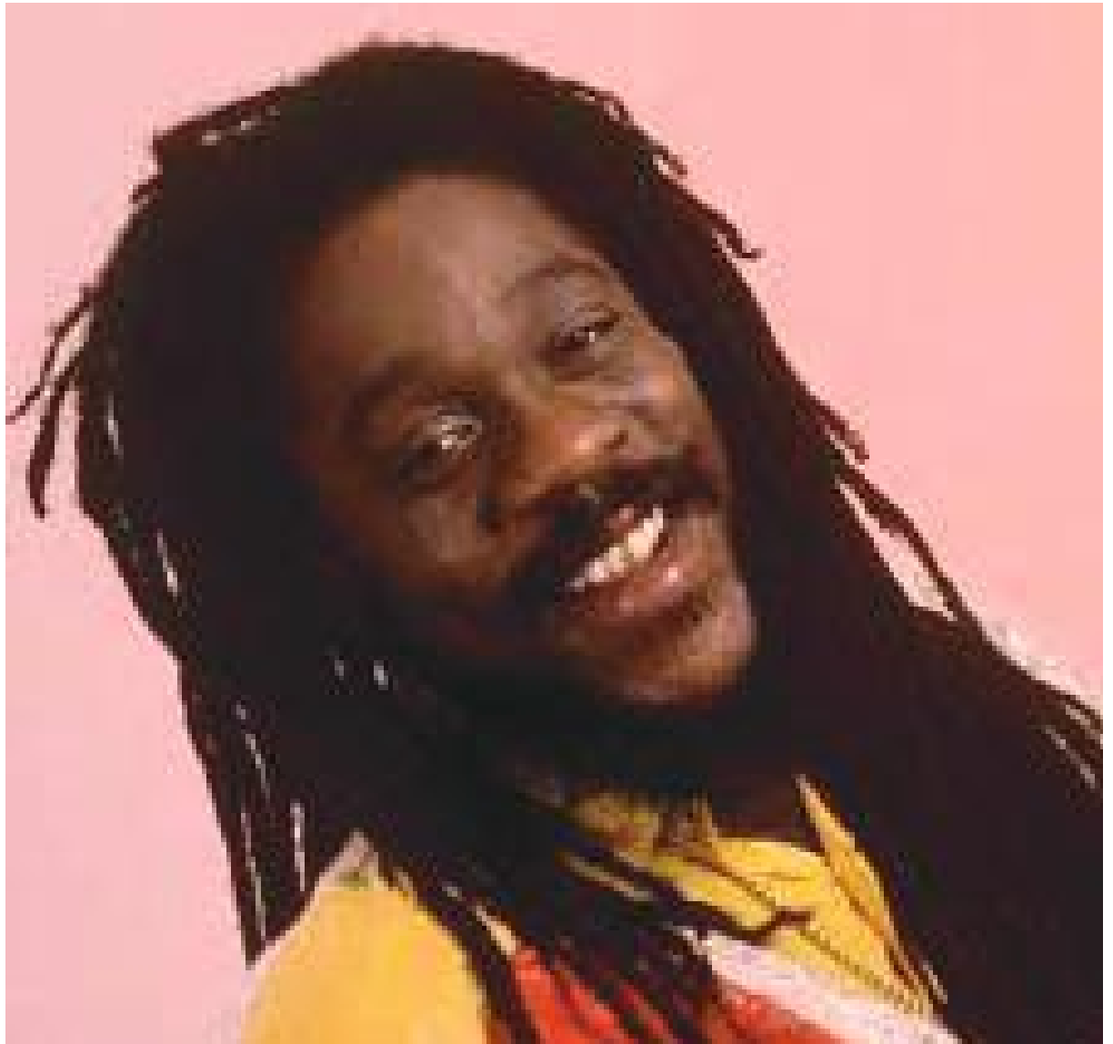
Dennis Brown was the highest ranked Jamaican singer on the list

Toots Hibbert of Toots and the Maytals was ranked 94, with the publication recognizing him