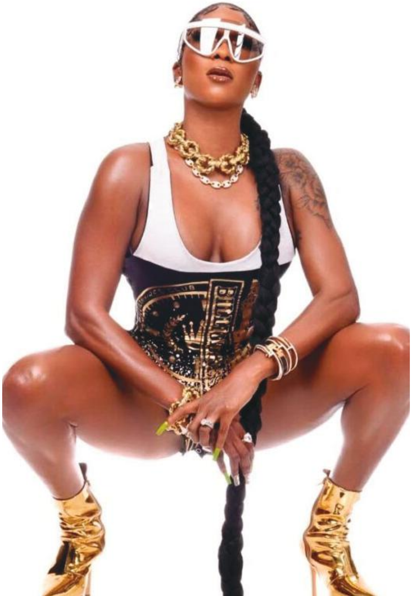
Patrice Roberts' song Mind My Business is the worldwide number one soca song of 2022

Roberts will be hosting her now signature event Strength Of A Woman on February 15.