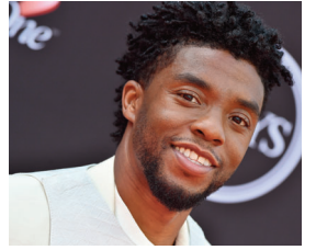
Rihanna tribute to Chadwick Boseman

SHENSEEA NOMINATED FOR TOP EUROPEAN MUSIC AWARD