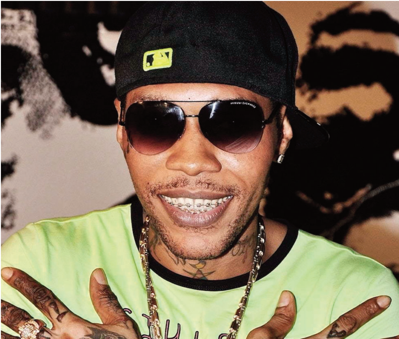
Vybz Kartel: transferred to another prison

In the meantime, Vybz Kartel was abruptly transferred in mid-October from Horizon to GP, leading to his attorney issuing a scathing rebuke of the Correctional Department.