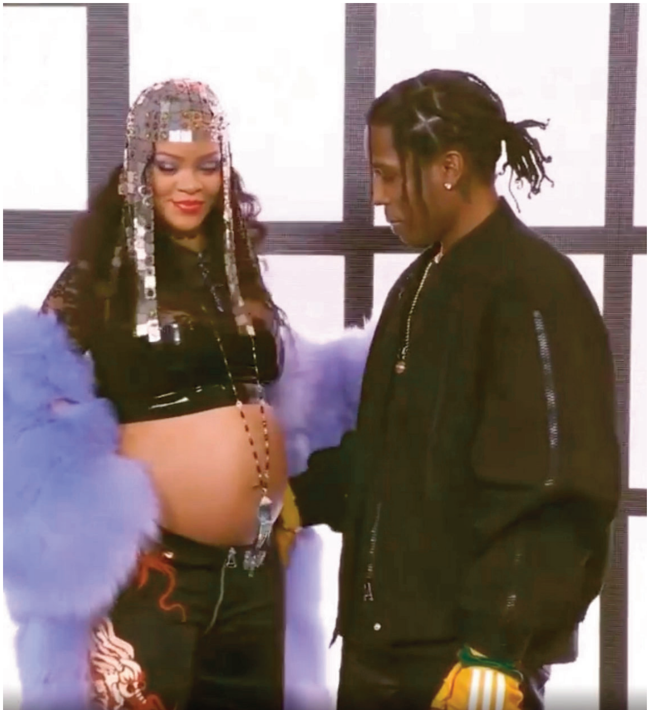
A$AP Rocky with Rihanna before the birth of their child

spotted in the studio working on new music, with Pusha T also showing up to the recording. Now it seems that music will not see the light of day because of Ye's rant.