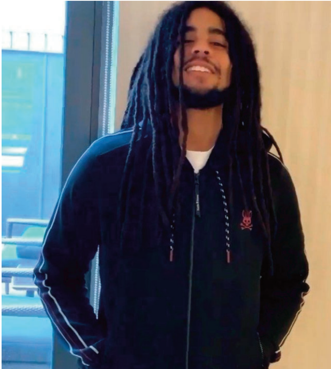
Skip Marley: Bob’s grandson denied entry into Canada

There is another box on the document that was ticked, “You are no longer barred from entering Canada by an order or regulation of the Governor in Council under the Emergencies Act or the Quarantine Act, and an officer may enter