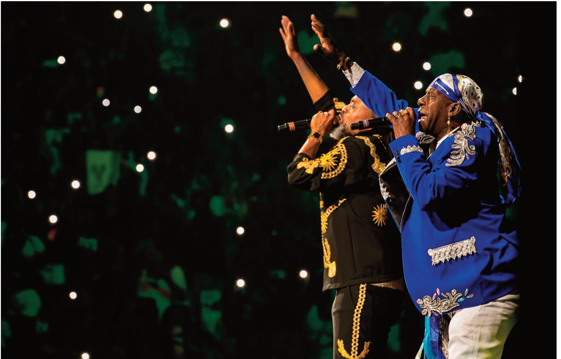
SOCA AT BARCLAYS CENTRE: Soca superstars Machel Montano and Superblue are pictured on stage at New York’s iconic Barclays Centre on September 5, where they performed for a 100% capacity crowd at the venue’s first ever Soca concert. The event, billed as Soca Kingdom – 40 years of MM, saw Montano perform a litany of his biggest hits after he arrived on stage in a self-driving Tesla with custom “MM 40” plates. The event was timed to coincide with New York’s famed Labour Day Mas.