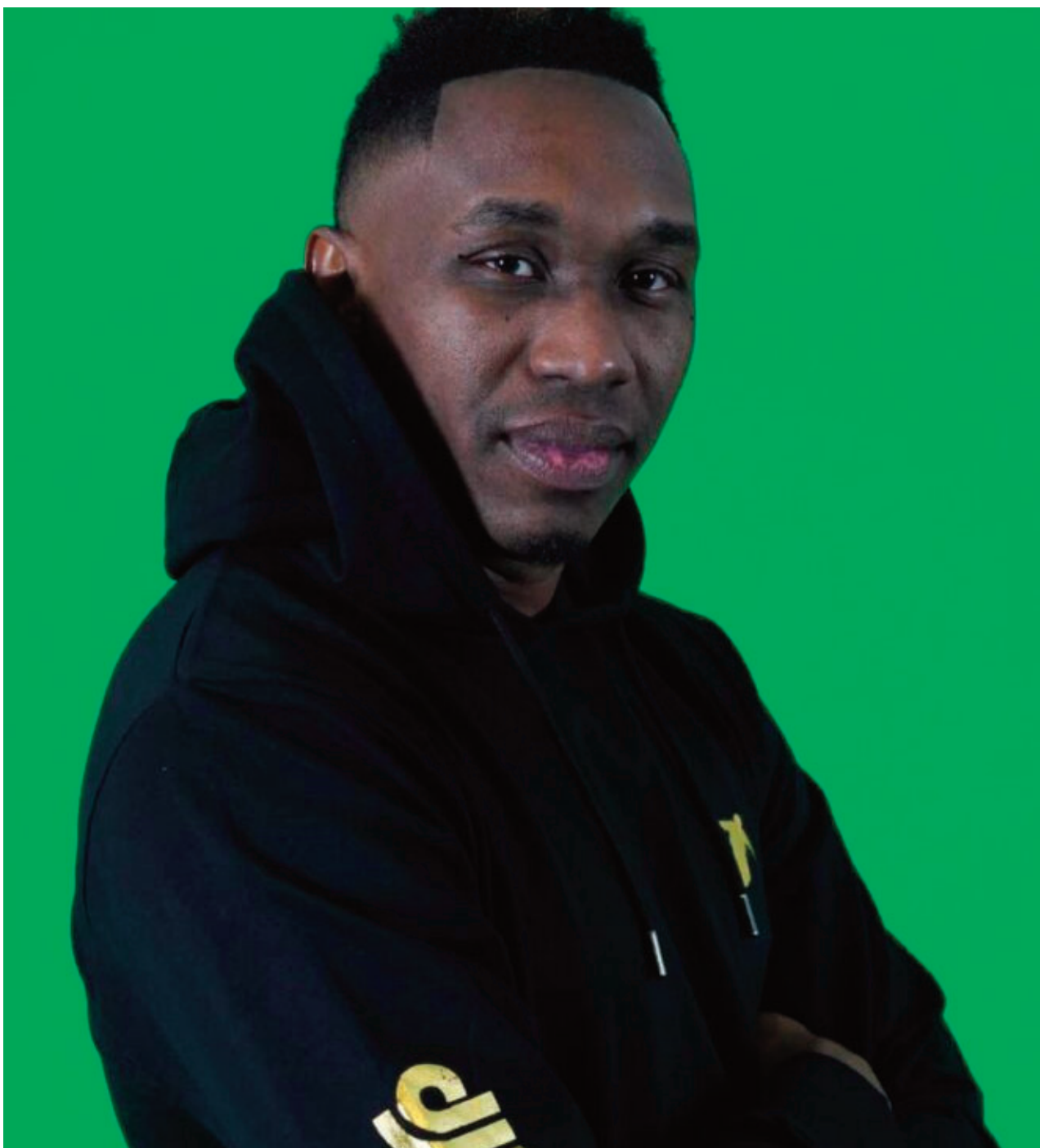
Dwayne DJ Bravo teams up with soca general Iwer George