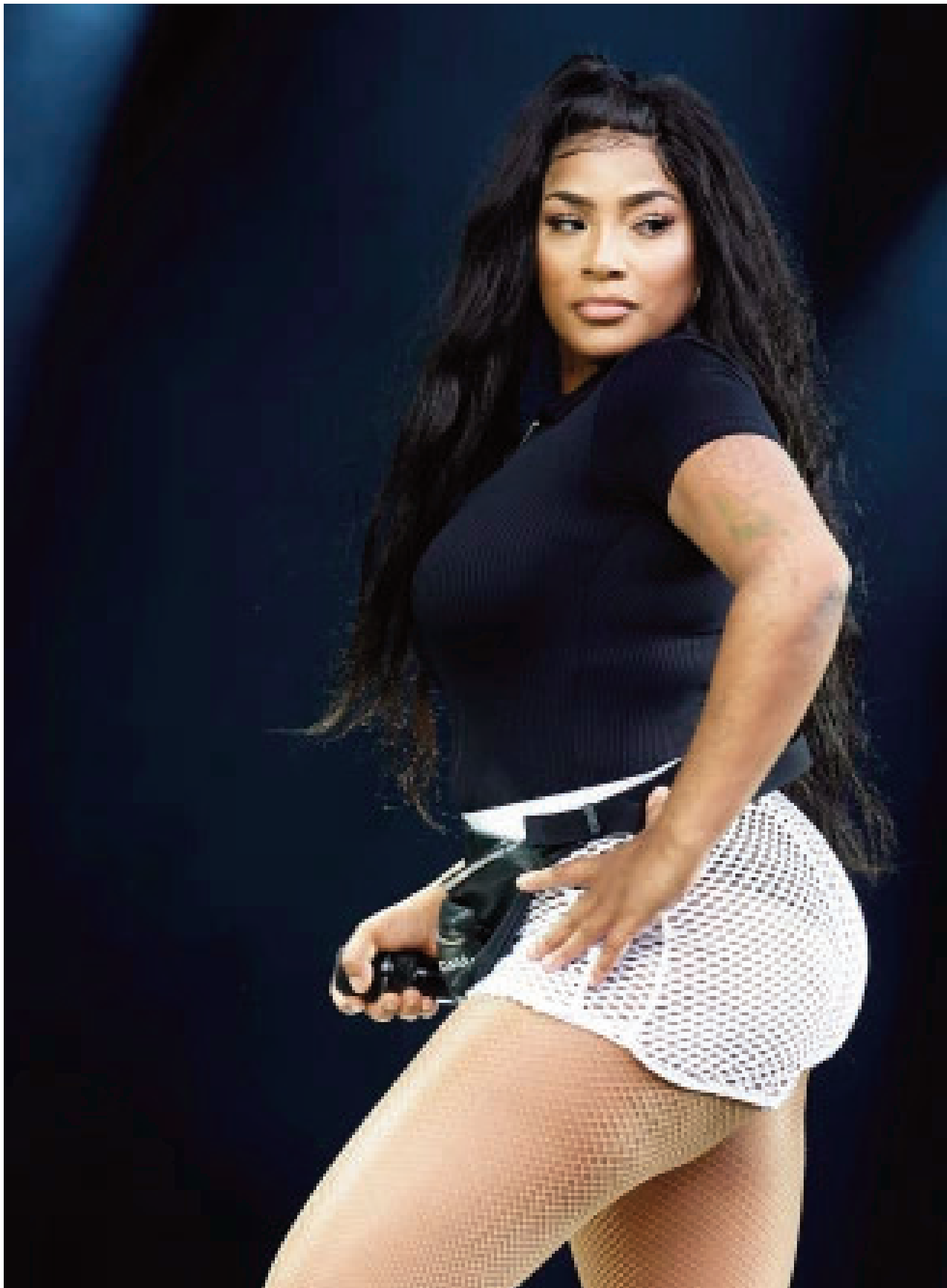
Stefflon Don defended Jamaicans, saying they work hard

Amid the Twitter backlash, Restaurant of Jamaica which owns the KFC franchise on the island is in the hot seat after an alleged August 2022 employee contract was leaked online. The contract allegedly pays employees JM$20,000 or U$131 per hour for 40hrs work weeks. The salary also includes $130 per hour (less than 1 USD.)