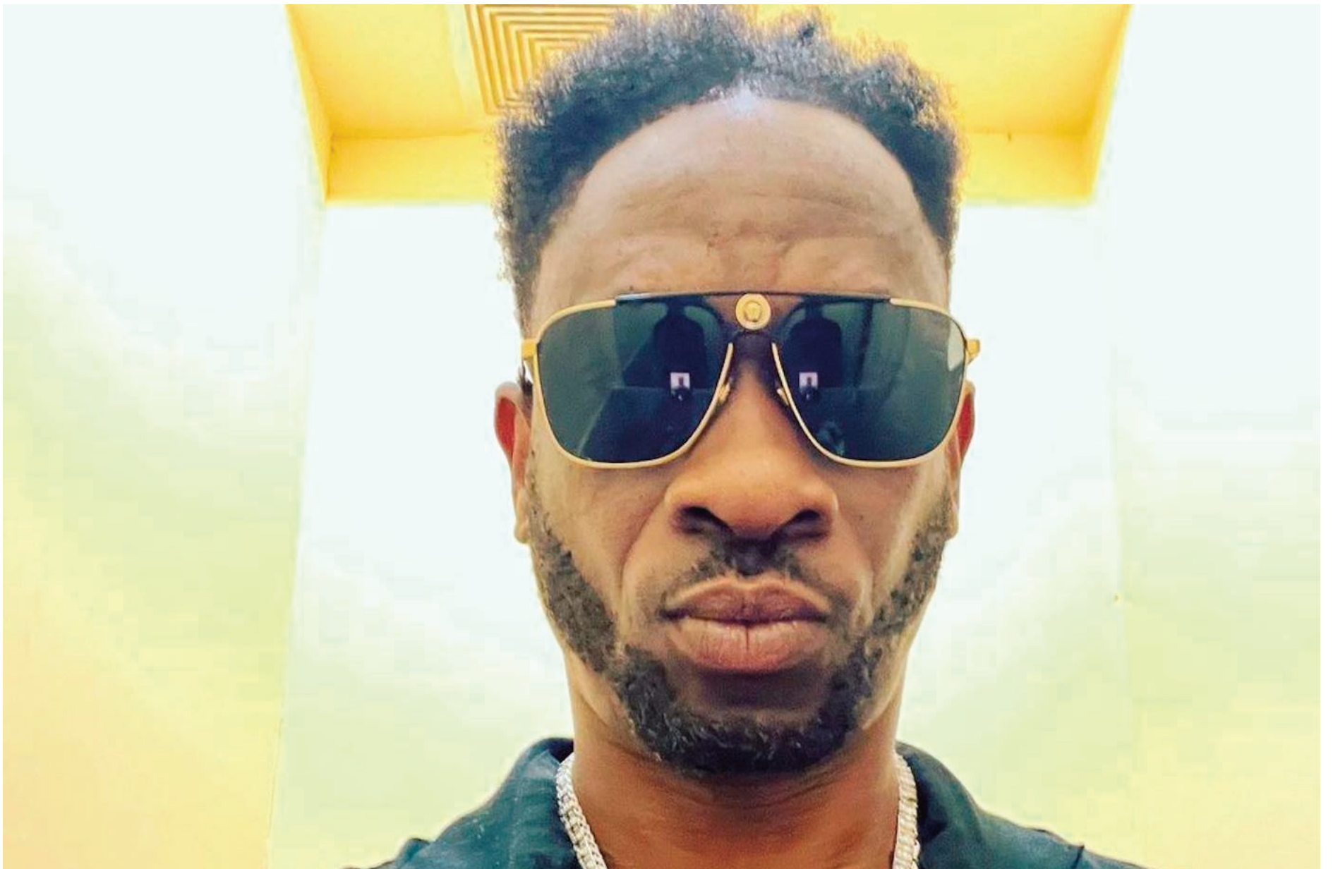
The new look Bounty Killer without his trademark cornrows