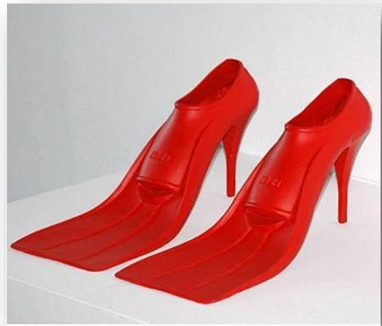
Practical yet Chique footwear for moist gardens

If you haven't guessed it yet, Spring is just around the corner! I am hoping our wet winter will give our plants a kick-start with ample moisture in the ground. I'm loving seeing our daylilies beginning to wake up.