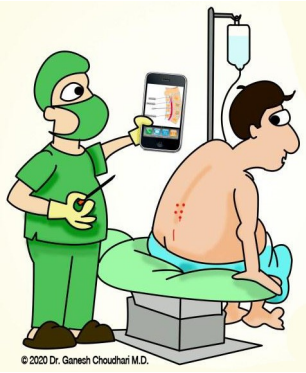
"I probably should have been more concerned when I saw my surgeon using Google Maps."