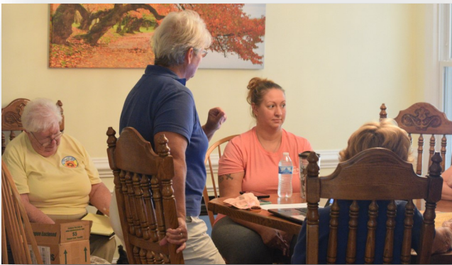
September Business Meeting