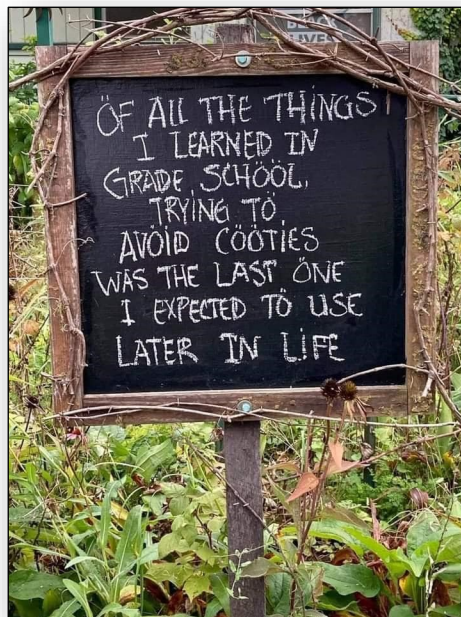
Can't have opinions about truth