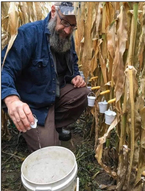
Collecting corn syrup

This is a working firehouse. DO NOT PARK in front of the building. Park on the left side or in the back of the station. The entrance we will use is on the left side.