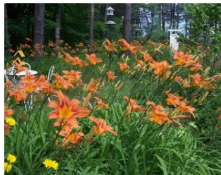
20 wild Orange Day Lily ('Tawny 'Ditch Lily') Pond... WetNWildGardens ★★★★★ (3,826) $55.99 FREE shipping