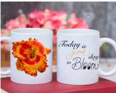
Today is your day to bloom orange daylily flower, ... LastingDreamsDesigns ★★★★★ (11) $19.99

The holiday season is upon us big time. Here are some last minute gift ideas I found in my search for presents for family and friends. With the exception of one item, they all can be found on ESTY .