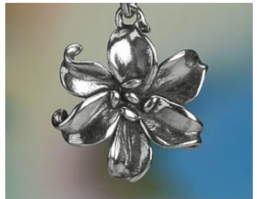
Sterling Silver Daylily or Lily Charm Garden Flowe... Jewelbecharmed ★★★★★ (16,271) $16.95