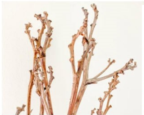
dried daylily stems ScratchHouseTX ★★★★★ (1) $16.00