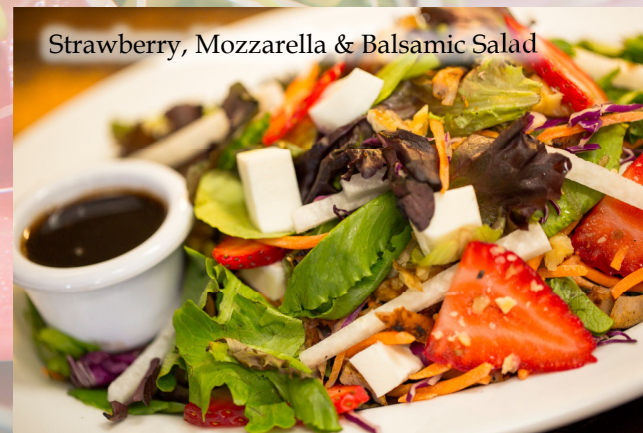
Strawberry, Mozzarella & Balsamic Salad

Mixed Greens with Chicken, Olives, Peppers, Cucumber, Cherry Tomatoes, Red Onion, Pepperoncini, Feta Cheese and Herb Vinaigrette