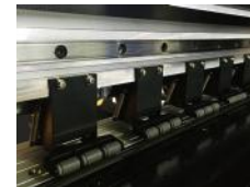
THK high-precision mute rail