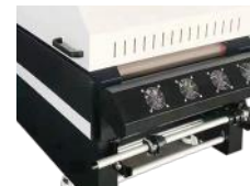
With belt system, you can cut off files, while printing. Since the film is fed by air suction system.