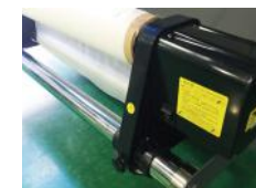
External power supply, intelligent rolling system.