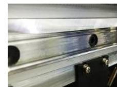
Modular platform to ensure printed material is flat and level