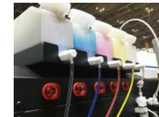
Stable bulk system ensures amazing printing speed.