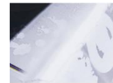
High quality hot melt powder, can be used repeatedly.