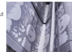
Efficient powder shaking device, powder shaking is clean.