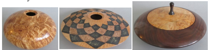
PIPEX 2015 Major Awards