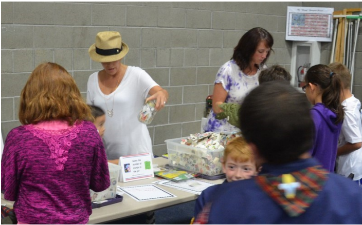
Youth Activities volunteers assisting youth at SEAPEX 2014

In December, I sent emails to the above clubs inquiring if the discounted dues for families and youth made a difference. How many youth members the club/society had, what activities did they offer throughout the year, and what else did the club do to promote youth membership?