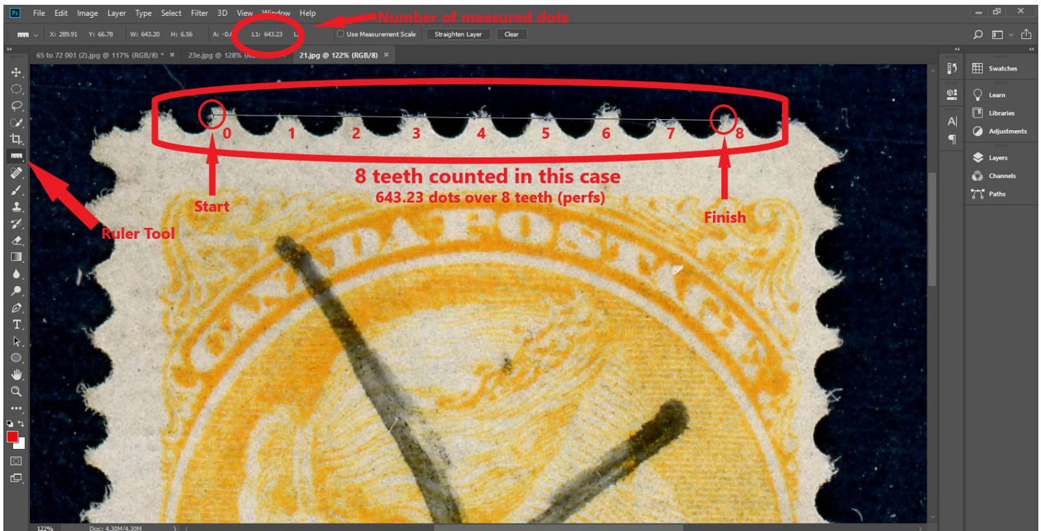
Fig. 1 Screen Image of Adobe™ Photoshop CC