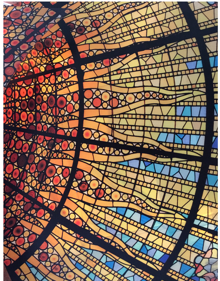
Rays of Hope Hospital de Sant Pau, Barcelona, Spain - 2017