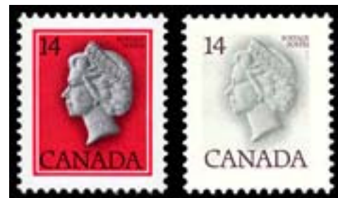
Left: As Issued --- Right: "White Queen Error"