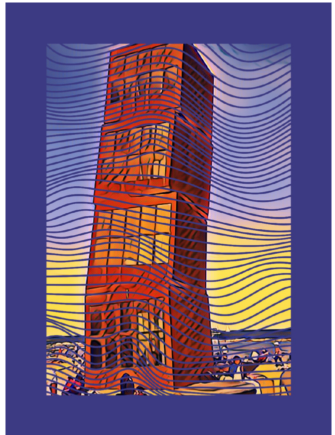
Barcelona Beach House by Darin Cherniwchan