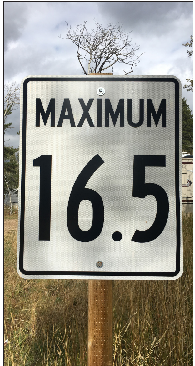
Cypress Hills Interprovincial Park Saskatchewan