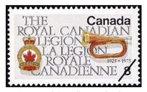
1975 Royal Canadian Legion issue

The battle of Arras was the first World War I battle in which all four divisions of the Canadian Expeditionary Force participated together. When the memorial was created, France deeded 250 acres of the battlefield to Canada to honour the role that Canadian troops played during the battle and during the war.