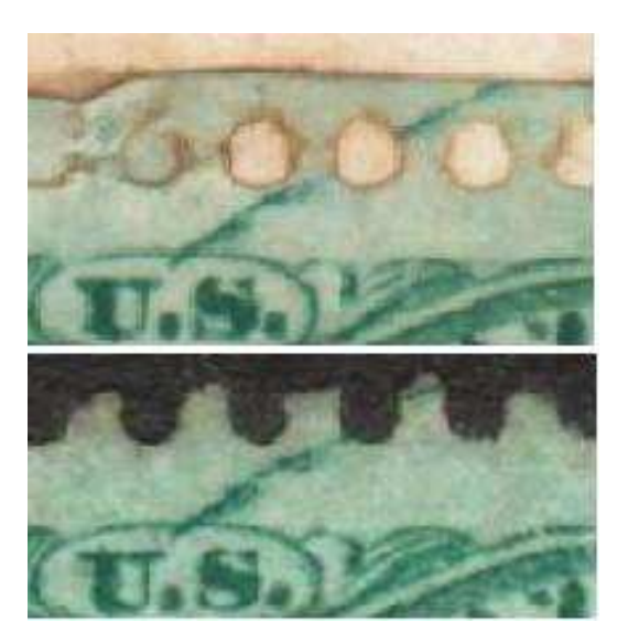
Enlargement showing the plate crack or scratch in both copies of Scott R17C

Reprinted with permission from the author and from the Oregon Stamp Society Album Page, Vol. XXXIII, no. 10, December 2010, pp. 12-13.