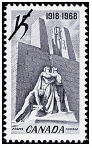
1968 issue for the 50th anniversary of the end of World War I

A 1939 issue shows the National War Memorial on Parliament Hill in Ottawa. The memorial was originally constructed to honour Canadians who died in World War I. The dates 1939-1945 and 1950-1953 were subsequently added for those who served in World War II and the Korean War. The memorial features 22 figures advancing through a granite archway, representing all branches of the armed forces who served in World War I. Atop the arch are two large bronze figures representing Victory and Liberty. The War Memorial is the site of Canada' annual National Remembrance Day Service. The Tomb of the Unknown Soldier is at the base of the memorial.