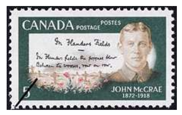
1968 Canadian stamp commemorating the 50th anniversary of John McCrae's death.

Several of the memorials that honour Canadian men and women who sacrificed their lives during wartime are commemorated on Canadian stamps. Two of the memorials are located in Ottawa, Ontario, Canada's capital.