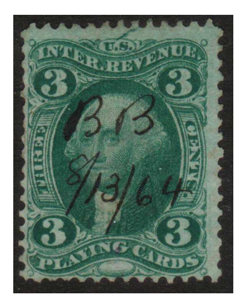
Scott R17c with "B B 8/13/64" manuscript cancel