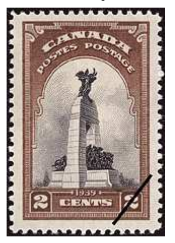
1938 Memorial Chamber, 1939 National War Memorial

A 1938 issue shows the Memorial Chamber of the Peace Tower in the Parliament Buildings in Ottawa. The right foreground of the design shows the Alter of Remembrance, which lists the 112,000 Canadians who have died for their country since 1867.