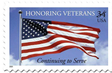
2001 issue honoring US veterans

Several US stamps also honor the US Veterans' Day holiday and those who served in World War I, World War II, and the wars in Korea and Vietnam.