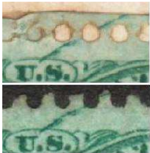
Enlargement showing the plate crack or scratch in both copies of Scott R17C