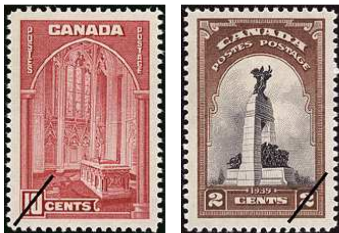
1938 Memorial Chamber, 1939 National War Memorial

The battle of Arras was the first World War I battle in which all four divisions of the Canadian Expeditionary Force participated together. When the memorial was created, France deeded 250 acres of the battlefield to Canada to honour the role that Canadian troops played during the battle and during the war.