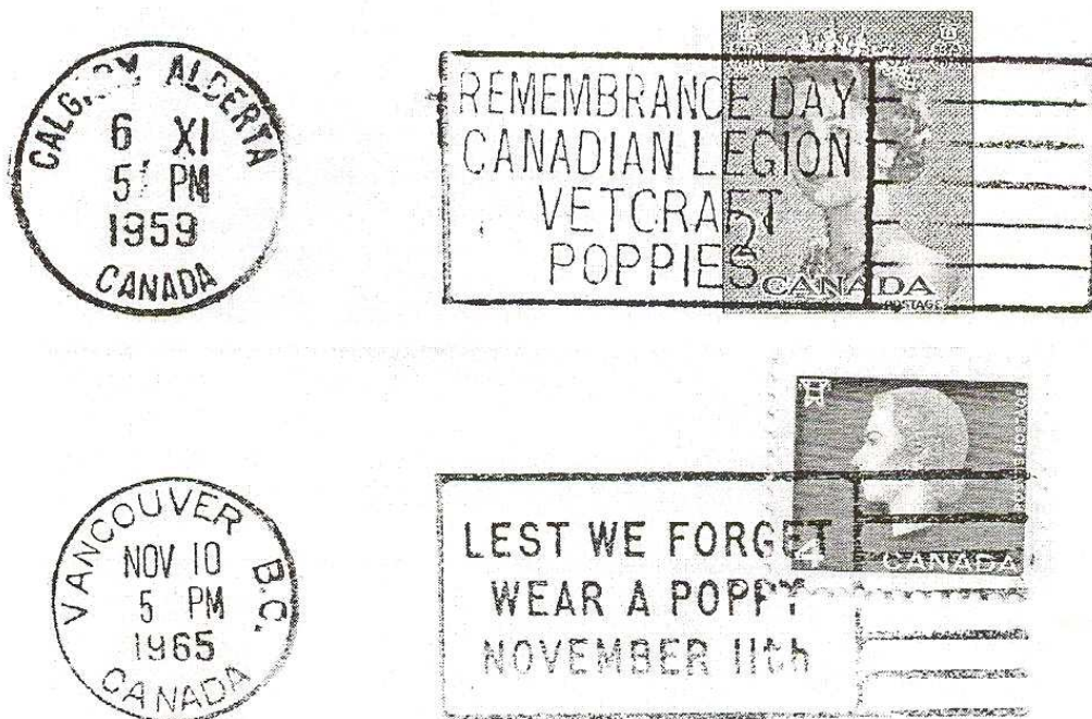
1959 Calgary, Alberta and 1965 Vancouver, British Columbia slogan cancels for Canadian Remembrance Day