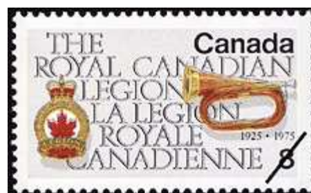
1975 Royal Canadian Legion issue

A 1939 issue shows the National War Memorial on Parliament Hill in Ottawa. The memorial was originally constructed to honour Canadians who died in World War I. The dates 1939-1945 and 1950-1953 were subsequently added for those who served in World War II and the Korean War. The memorial features 22 figures advancing through a granite archway, representing all branches of the armed forces who served in World War I. Atop the arch are two large bronze figures representing Victory and Liberty. The War Memorial is the site of Canada's annual National Remembrance Day Service. The Tomb of the Unknown Soldier is at the base of the memorial.