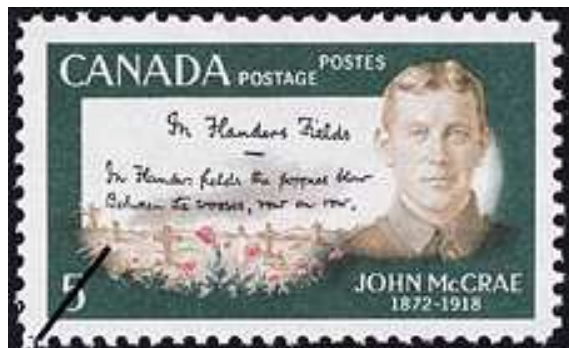
1968 Canadian stamp commemorating the 50th anniversary of John McCrae's death.

Several of the memorials that honour Canadian men and women who sacrificed their lives during wartime are commemorated on Canadian stamps. Two of the memorials are located in Ottawa, Ontario, Canada's capital.