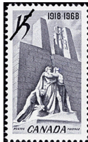
1968 issue for the 50th anniversary of the end of World War I

Several of the memorials that honour Canadian men and women who sacrificed their lives during wartime are commemorated on Canadian stamps. Two of the memorials are located in Ottawa, Ontario, Canada's capital.