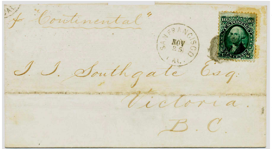
Figure 2: November 25, 1868 San Francisco to Victoria folded letter sent at the 10\phi per ½ oz rate

I will first discuss the postage rates for a single-weight (half-ounce) US domestic letter and compare them to those for similar-weight letters from San Francisco to Vancouver Island. From April 1, 1855 to June 30, 1863, the US domestic letter rate for less than 3,000 miles was 3¢ per ½ oz, and the rate for greater than 3,000 miles was 10¢ per ½ oz. A uniform domestic rate (no zones) of 3¢ per ½ oz came into effect on July 1, 1863. This rate structure lasted for two decades.