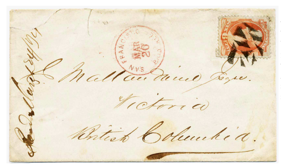
Figure 3: March 20, 1874 San Francisco to Victoria, sent at the 6¢ per ½ oz rate

The final cover (Figure 3) was mailed after British Columbia had joined Canada. Therefore, there was no Colonial postage due. This cover—mailed at San Francisco on March 20, 1874 and received in Victoria on March 24<sup>th</sup> —bears a 6¢ Lincoln stamp to pay the 6¢ per ½ oz rate.