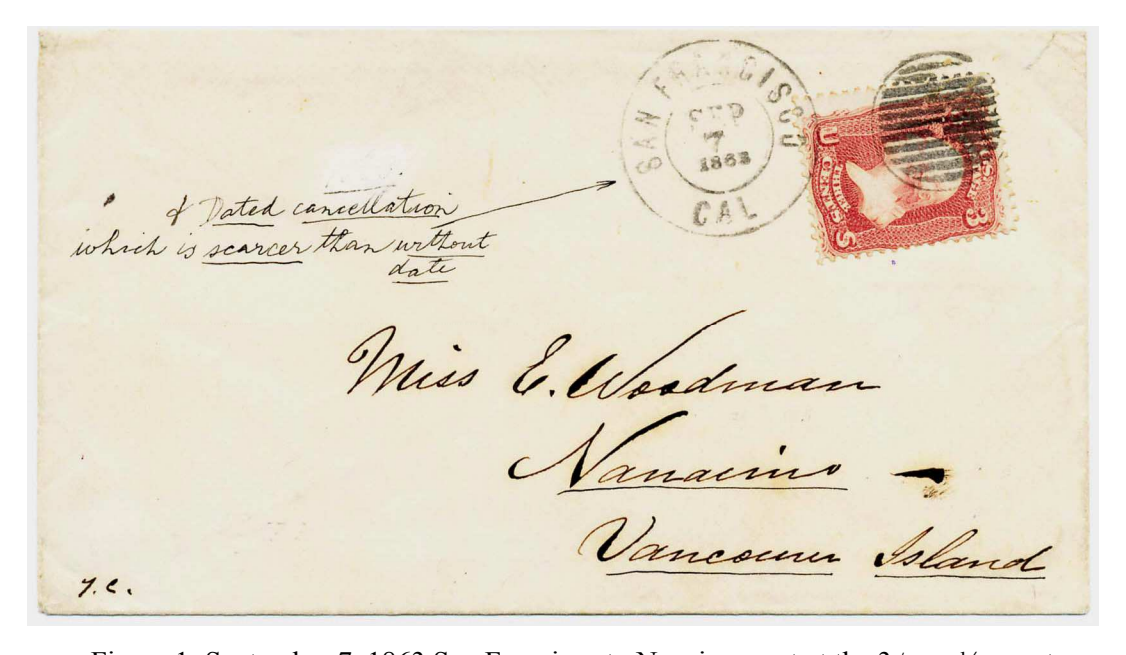
Figure 1: September 7, 1863 San Francisco to Nanaimo sent at the 3¢ per ½ oz rate