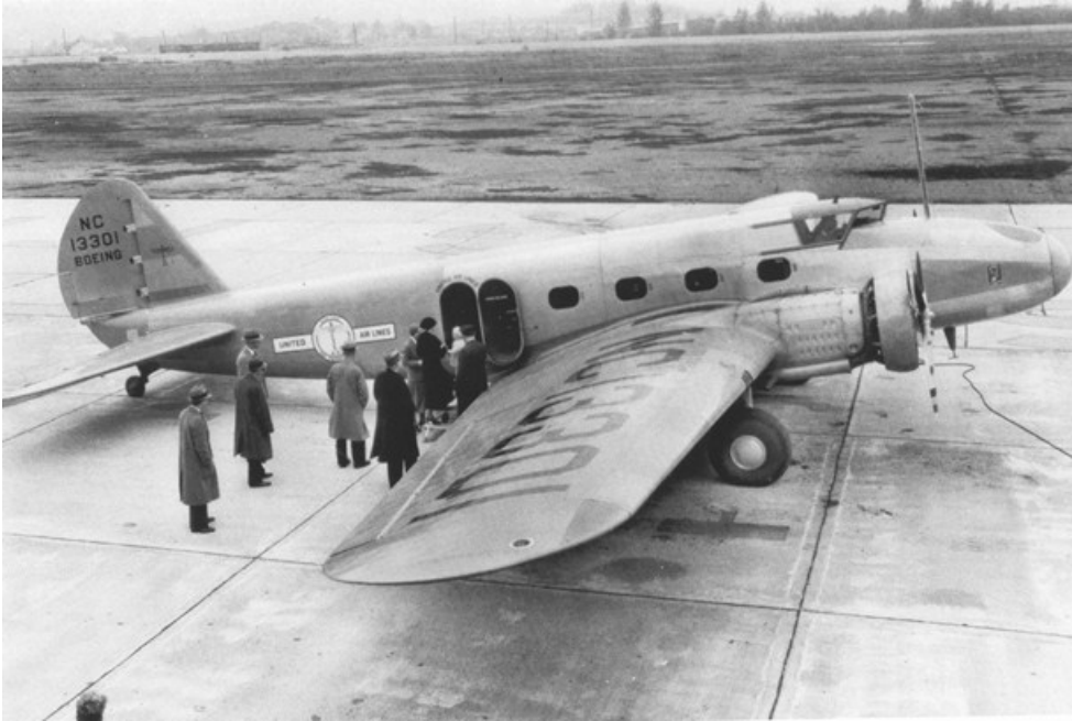
Passengers boarding the Boeing 247, NC13301 at Boeing Field, April 5, 1933 for the first scheduled commercial flight of this type, operating the noon shuttle to Portland for the Pacific Air Transport division of United Air Lines.

last until the first aircraft was delivered. Plagued with design and equipment delivery issues, certification flight testing of the first plane, NX13301, didn't begin until early March 1933. Then, in what would be considered today as an amazingly short time, Raymond Quick, engineering inspector of the Department of Commerce completed tests on the plane, and recommended authorization for an Approved Type Certificate (#500) by the end of the month. Thursday March 30, the number 2 airplane, NC13302, was ferried to Cheyenne by Slim Lewis and Erik Nelson for pilot training and route proving over the Boeing Air Transport Division's Chicago to San Francisco route.