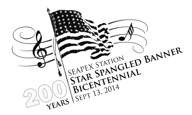
SEAPEX Show Cancel