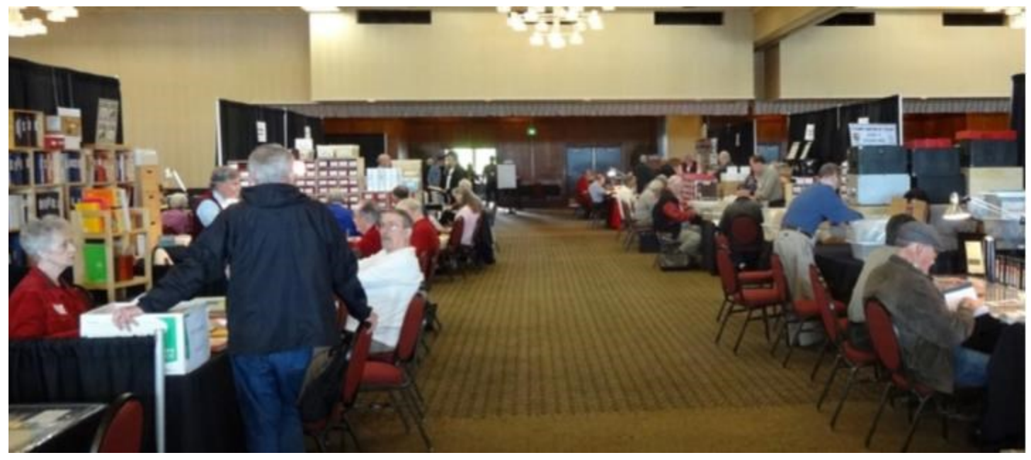
— by Lucien Klein

PIPEX 2014 came and went over a busy three days between 9 and 11 May filled with trying to find time to visit the dealers, look at the auction lots, view the exhibits, attend meetings and seminars, and volunteer time at some society booths. More than six-hundred people from all over the country attended the show during those three days. The dealers stayed busy all three days and those dealers asked reported that it was a good show for them.