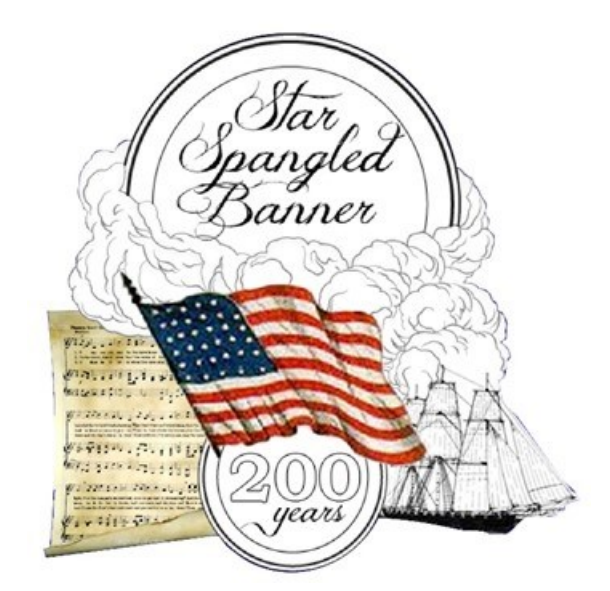
SEAPEX Show Cachet

Please visit our website at www.seapexshow.org for more details.