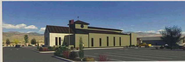
View Looking Southeast