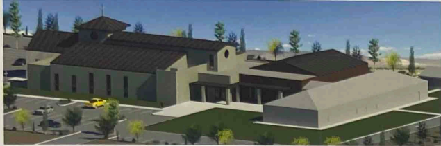
View Looking Northeast