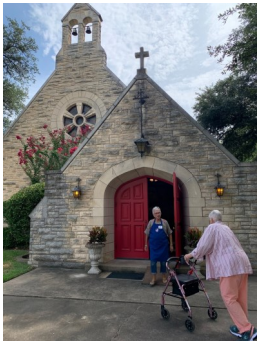
Arriving at St. Paul's