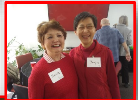
Xmas Day Brunch