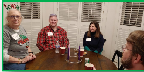
Serendipity at Barats