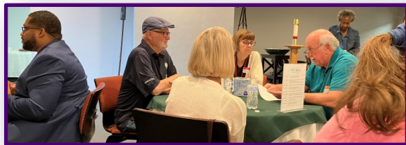
UNDIVIDED held at St. Clare's