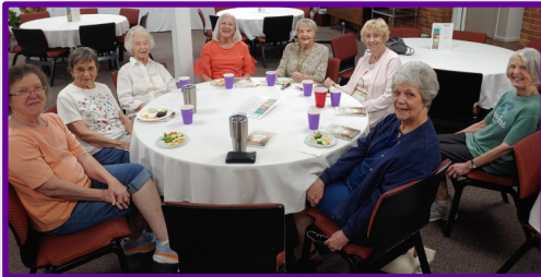
Grief Group 6/14