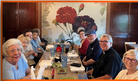
Out to Lunch Bunch 6/20 at Noodles & Dumplings