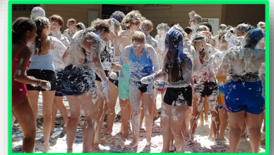
'Bedlam' with shaving cream