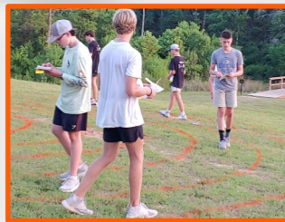
Walking the Labyrinth