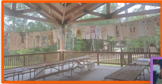
Flags are up