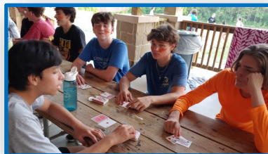
Fun with Games