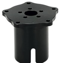
Fits Attwood 238 Series