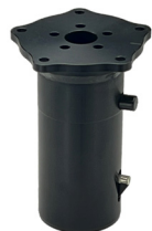
Fits Attwood 238 Series