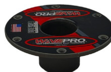
300-0140-000 Recessed Cup