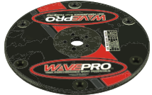
6 Bolt 8" Base Plate