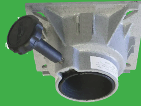
360-0030-000 Fits Swivel Eze 278 Series