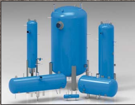
RVS Can Supply Carbon and Stainless Steel Vessels from 4" to 180" Diameter, Various Lengths and Temperature Applications, Packaged Skid Systems Including Controls