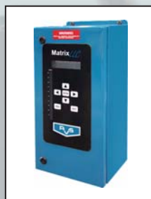
Matrix LLC Level Control

The Matrix and Matrix LLC use the latest in microprocessor technology to provide a total control solution for Recirculator Packages and level control for refrigeration vessels. Factory packaging, wiring, and testing provides a single point power connection on-site for fast installation and simplified start-up.