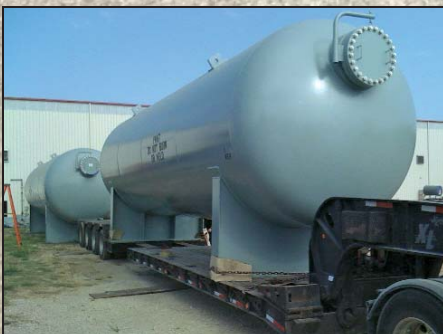
120" x 600" Mixed Refrigerated Surge Drum