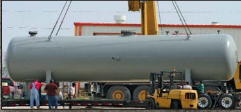
108" x 540" Horizontal Propane Receiver