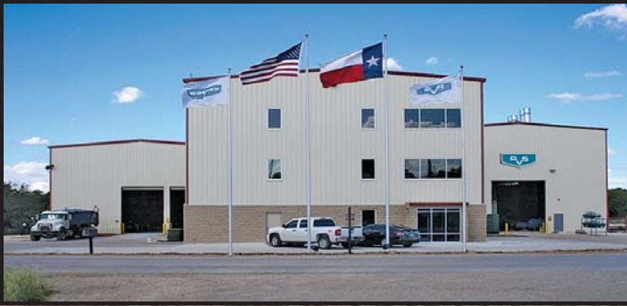
RVS Corporation, Bryan, TX.

Refrigeration Valves and Systems Corporation (RVS) was founded in 1983 as an ASME pressure vessel manufacturer serving various industrial applications. In 1994, EVAPCO, Incorporated acquired RVS as a wholly owned subsidiary. EVAPCO's industry leading heat transfer products along with engineering innovation and financial strength enabled both companies to increase their market share.