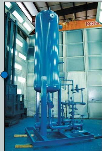
21' W x 25' H x 50' State-of-the-Art Paint Booth with climate control for a professional finish