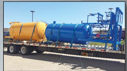
Pump Recirculator Package and High Pressure Receiver in IAR 2 Spec Colors