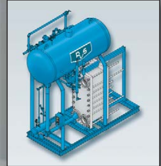
Plate and Frame Chiller Packages