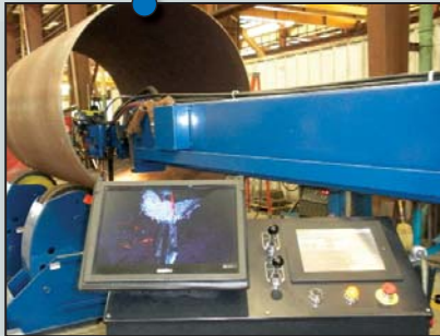
Three PLC Submerged ARC Welding Systems with 3-Axis Motion Control and a direct view vision system to control seam welding and provide real time inspection at 10x to 25x magnification