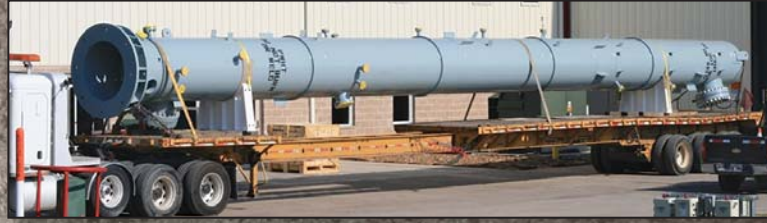
48" x 936" Vertical Contactor Ready for Shipment