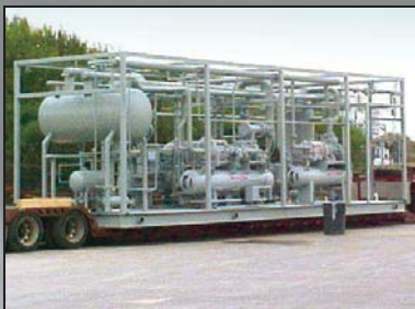
Refrigeration Skid Package