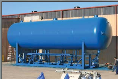
Custom 168" x 600" Horizontal Pumped Liquid Package