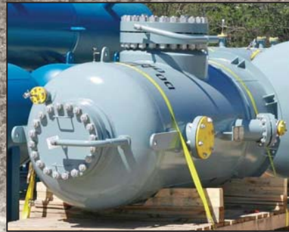
Mercury Guard Bed & Scrubber