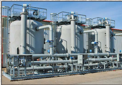
Water Filtration Skids