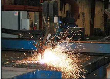
5 Axis CNC Plasma Machine