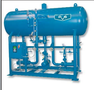
Horizontal and Vertical Liquid Recirculator Packages