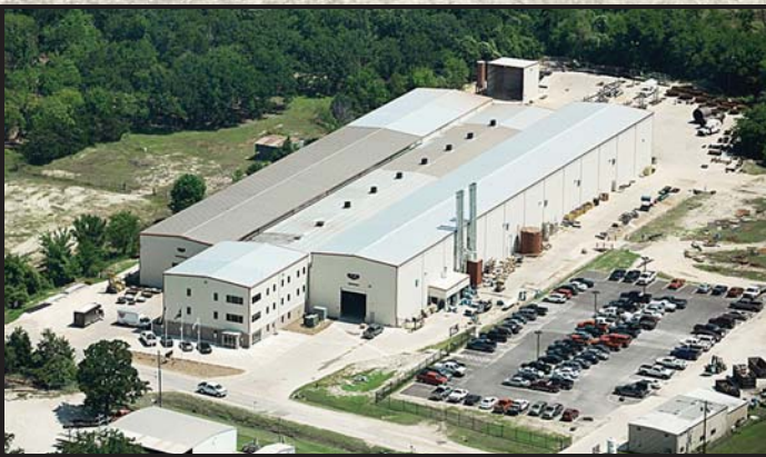
100,000 sq. ft. Manufacturing Facility and Office Complex

RVS is an employee owned company with a dedicated team committed to excellence. RVS partners with industry leading material and component suppliers who share this commitment. Manufacturing superior quality products, providing friendly industry leading service and on-time delivery are what make RVS the specialists in ASME pressure vessels.