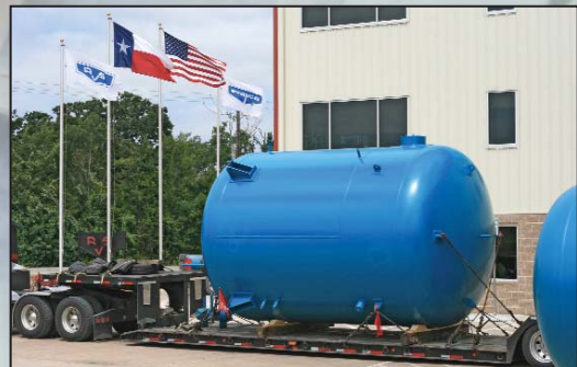
Custom 180" Diameter Vessel