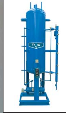
Intercooler and Accumulator Packages