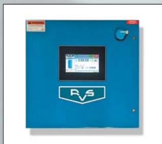
Matrix Microprocessor Control