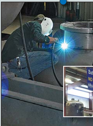
Veteran crew of ASME certified welders and other mechanics form the manufacturing team focused on quality and safety