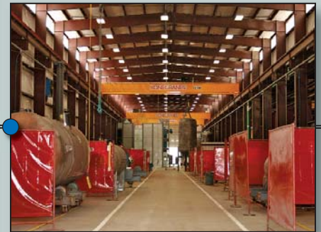
Three manufacturing bays, twenty-nine vessel welding stations and ten overhead cranes with hoist capacity of 100,000 lbs.