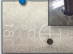
Etches Critical Features, Cuts & Bevels Holes in Plate, Shell, Pipe and Heads