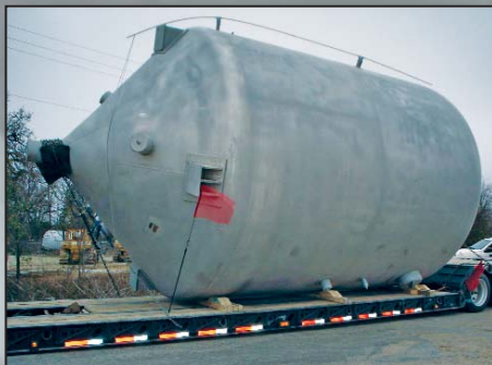
180" Diameter Stainless Steel Cone Head Recirculator