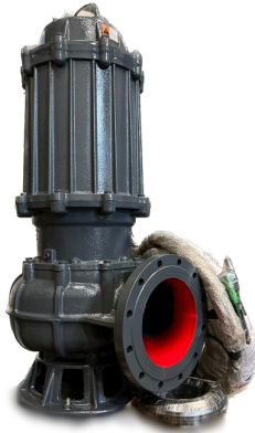
[ QPS10-460 ]