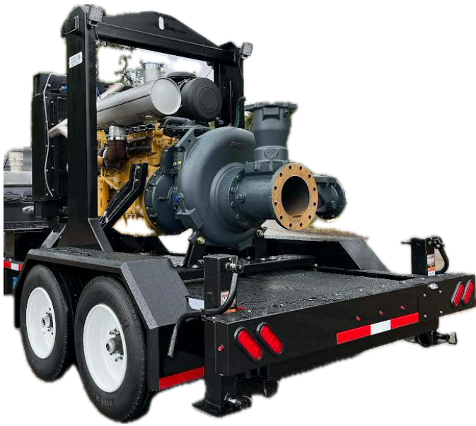
[ QPD-108HH17 ]