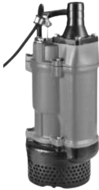
[ QPS3-220 ]