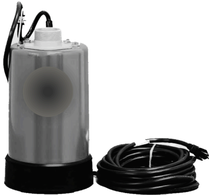
[ QPS2-120 ]