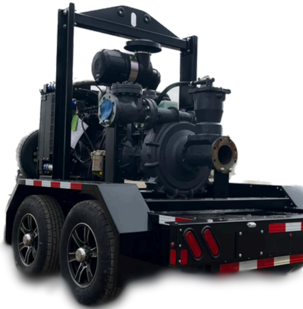
[ QPD-64HH22 ]

QUADRA QPD-64HH22 DIESEL POWERED PUMP SERIES HAS A STEEL EXTERIOR CONSTRUCTION, HEAVY DUTY HIGH TENSILE BEARING HOUSING WITH FULL STAINLESS STEEL INTERNAL WORKING COMPONENTS. THIS HIGH QUALITY DESIGN PROVIDES PREMIUM EFFICIENCY FOR HIGH HEAD/FLOW APPLICATIONS, FEATURING A STATE OF THE ART AUTOMATIC VAC ASSIST CHAMBER AND AN ENDURA SILICONE CARBIDE RUN DRY SEAL SYSTEM.