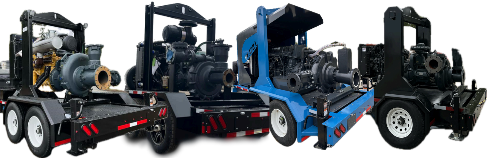
[ QPD-108HH17 ]