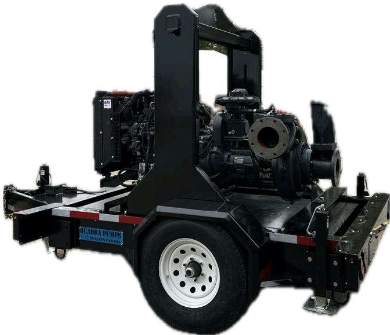
[ QPD-66MH12 ]

QUADRA QPD-66MH12 DIESEL POWERED PUMP SERIES HAS A STEEL EXTERIOR CONSTRUCTION, HEAVY DUTY HIGH TENSILE BEARING HOUSING WITH FULL STAINLESS STEEL INTERNAL WORKING COMPONENTS. THIS HIGH QUALITY DESIGN PROVIDES PREMIUM EFFICIENCY FOR HIGH HEAD/FLOW APPLICATIONS, FEATURING A STATE OF THE ART AUTOMATIC VAC ASSIST CHAMBER AND AN ENDURA SILICONE CARBIDE RUN DRY SEAL SYSTEM.