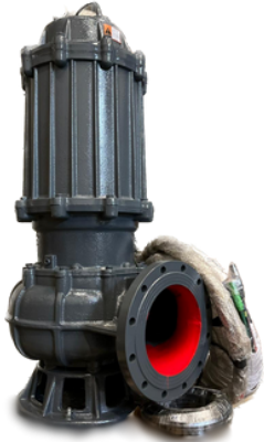
[ QPS10-460 ]