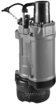
[ QPS6-460 ]