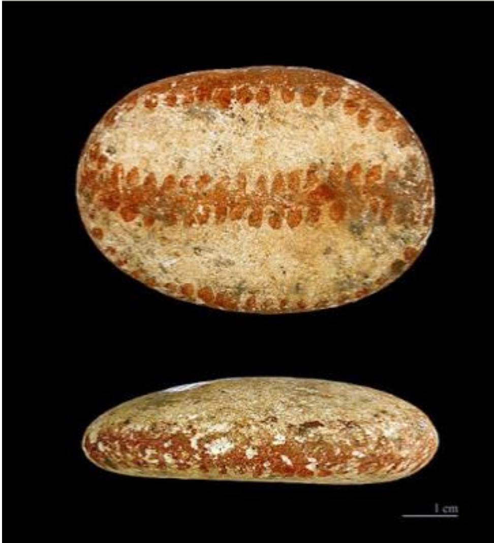
Azilian painted pebble

It has long been believed that the great Ice Age art of Europe disappeared with the decline of the Magdalenian culture about 12,000 BCE. The following culture in that area has been named the Azilian culture, and the main art practice associated with Azilian has been decorated pebbles.