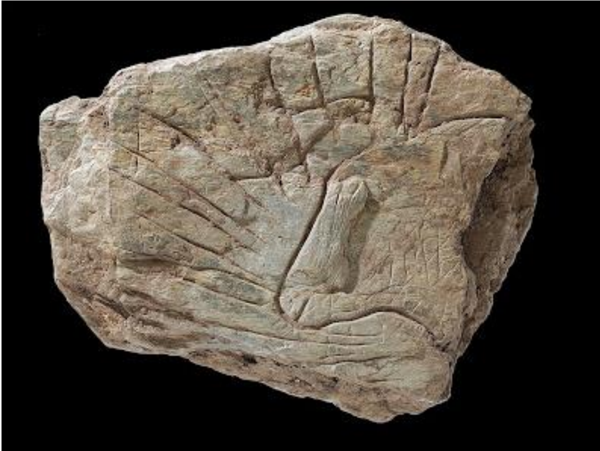
Engraved aurochs on schist plaque. Azilian, Le Rocher del'Imperatrice, France.

Realistic, larger-scale depictions of aurochs and horses provide evidence that cultural and religious beliefs had not totally abandoned the fascination in large animals found in previous cultures, and suggest that the evolution of these beliefs and mythology moved more slowly, lagging behind the evolution of tools to fit the new conditions the people lived in.