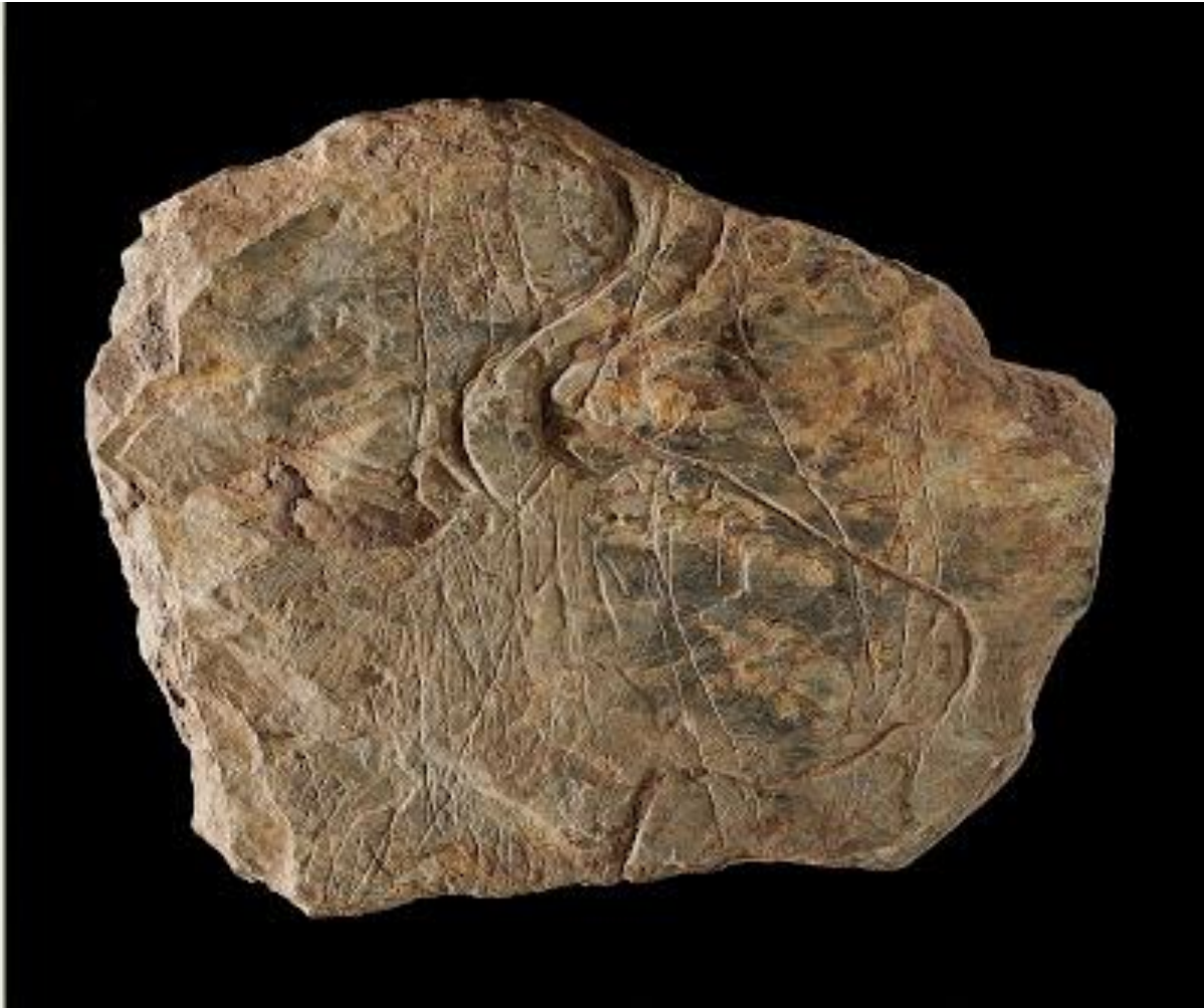
Engraved aurochs on schist plaque. Azilian, Le Rocher del'Imperatrice, France.

"Azilian pebbles carry simple designs coloured and/or decorated with paint made from red ochre (iron peroxide), applied from the creator's fingers. Dots, borders and bands of colour, zig-zags, ovals and dashes are featured. About 1400 pebbles like these were found at Le Mas-d'Azil, southwestern France." (Wikipedia)